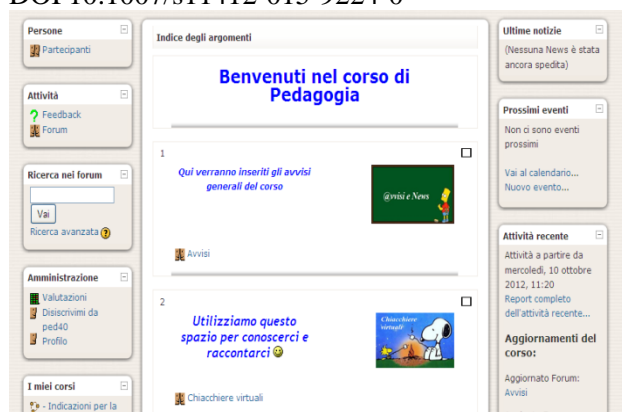
Figure 1. The online environment at the beginning of the activity