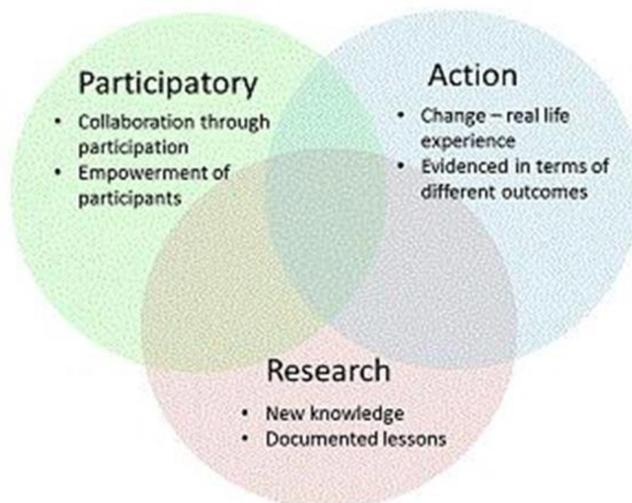
Figure 3. Participatory action research model (Learning for Sustainability, 2017).