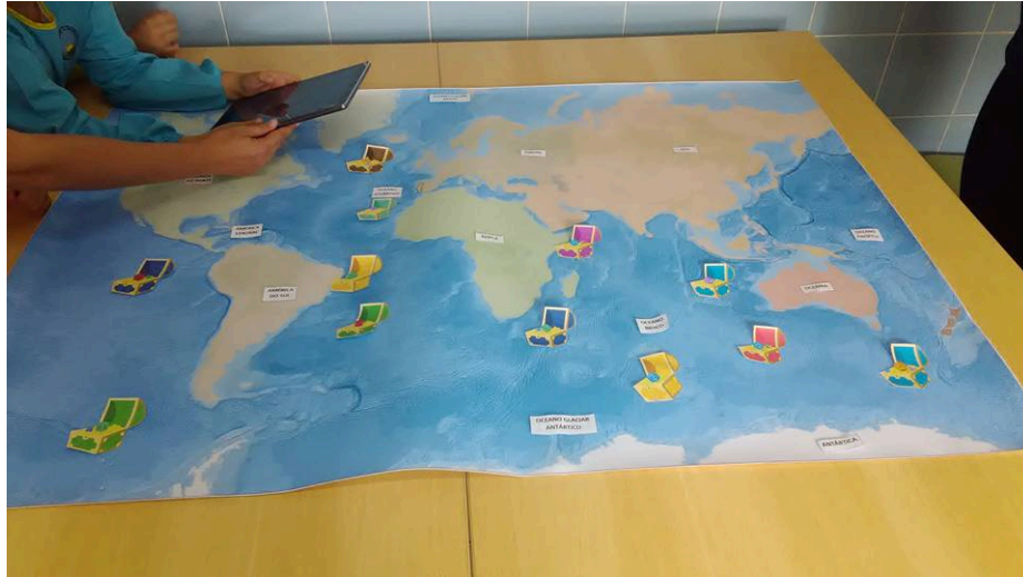
Fig. 2. – Oceans map and Treasure chest.

Researchers, recorded the whole process from the very start, reaching the place, until the end, leaving it. This will be useful to record and analyze emotions, commentaries and barriers during the use of the AR.