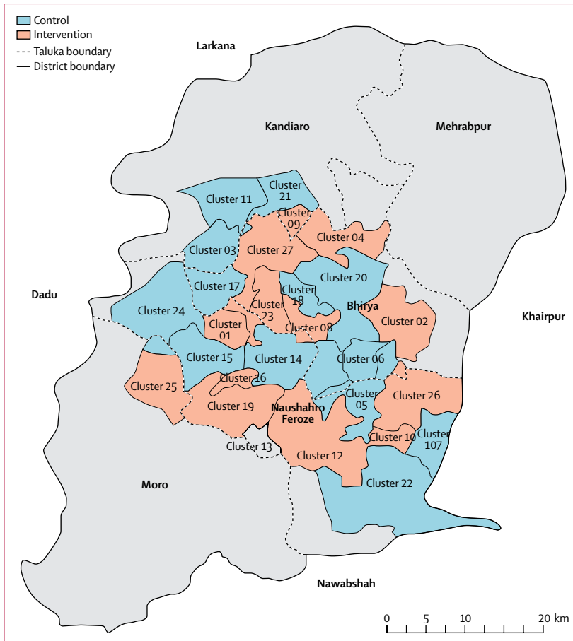
Figure 1: Study site and clusters

LHWs. Basic health units typically serve a population of 10 000–20 000 and have 10–20 affiliated LHWs. Rural health centres cater to a population of 25 000–50 000 and have 25–50 affiliated LHWs. Most LHWs have a catchment population of about 1000 individuals (120–200 households), are mostly resident in the same area, and are not transferred to other facilities or areas. In the original trial proposal, we anticipated the potential inclusion of 34 clusters representing the entire district.