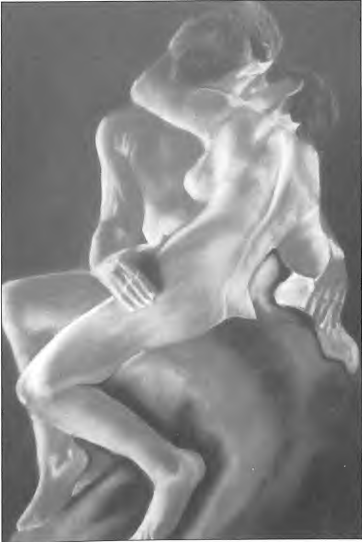
Ashlie Pence Third Place