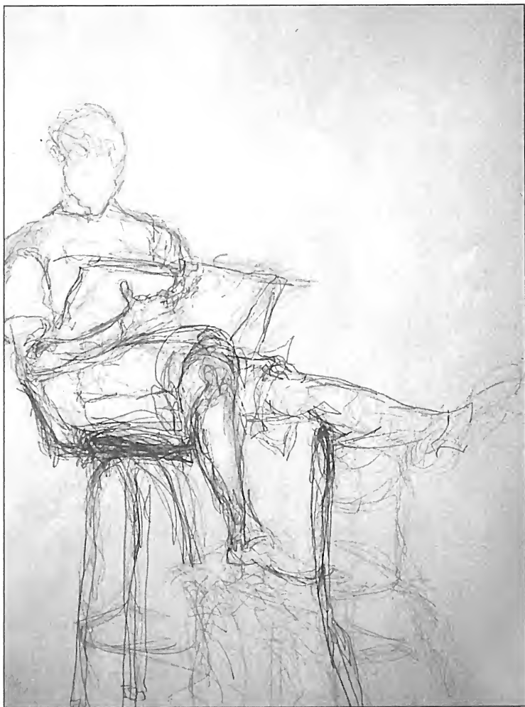
Roger Kollock Honorable Mention