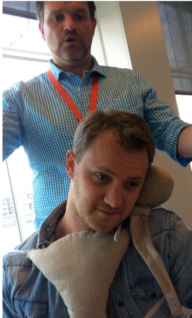
Figure 2. MobileHCI '15 workshop on Mobile Collocated Interactions With Wearables .

http://www.funkydesignspaces.com/collocated_wearables/