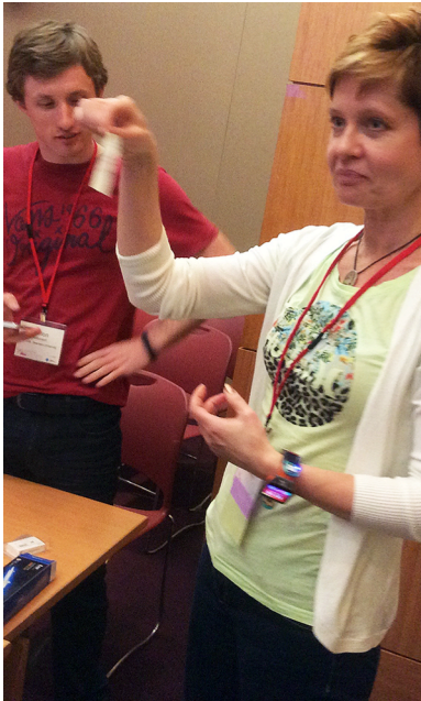
Figure 1. CHI '15 workshop on Mobile Collocated Interactions: From Smartphones to Wearables . http://www.funkydesignspaces.com/mobile_collocated/

In the morning, individual presentations were followed by group discussions where relevant topics were identified for the afternoon 'hands on' session.