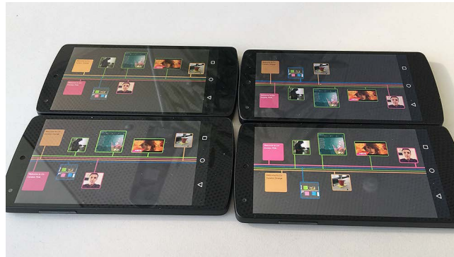
Figure 1. The prototype mobile application.