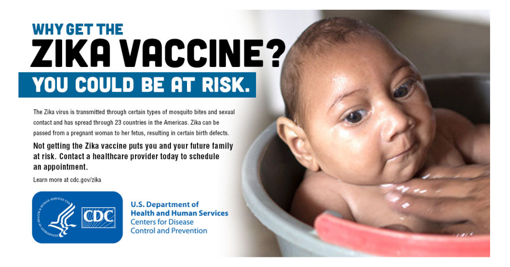
Figure 3 Loss-framed photo