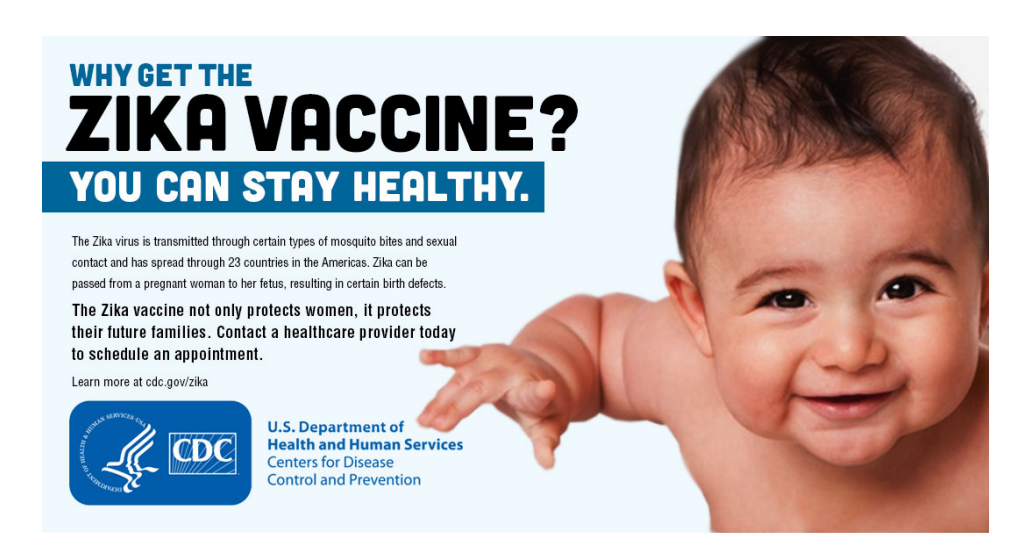
Figure 1 Gain-framed photo