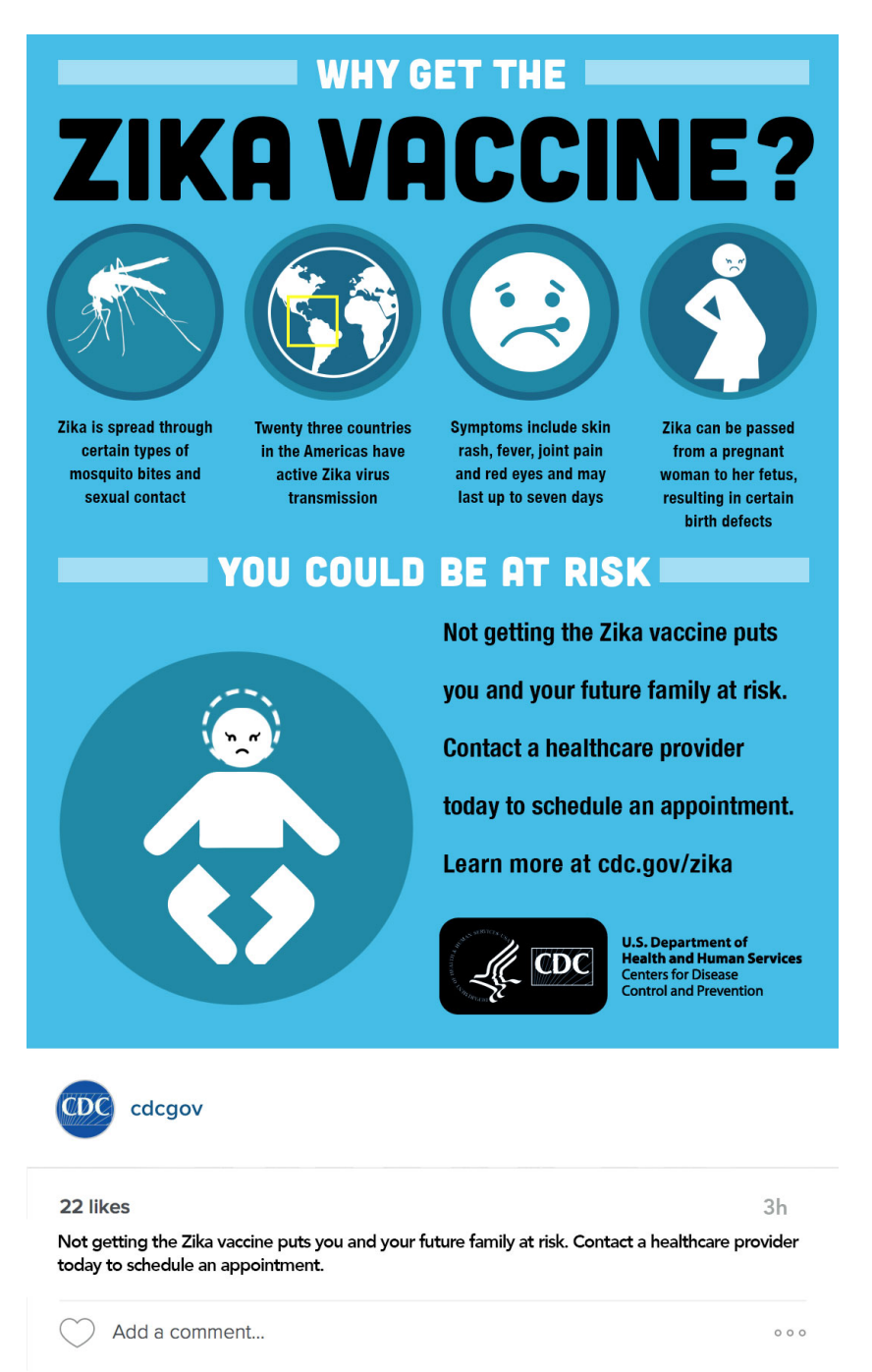
Figure 4 Loss-framed infographic