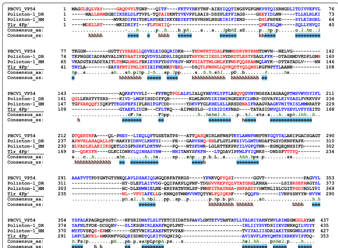
Figure 1 Multiple sequence alignment of the major capsid protein VP54 of PBCV-1 with the PY proteins of Polinton 1 from Danio rerio (DR), Polinton 1 from Hydra magnipapillata (HM), and protein 4Fp' from Tlr element. The last two lines in each block show consensus amino acid sequence (Consensus_aa) and consensus predicted secondary structures (Consensus_ss). The protein sequences are colored according to predicted secondary structures (red: alpha-helix, blue: beta-strand). Consensus predicted secondary structure symbols: alpha-helix: h; beta-strand: e. Consensus amino acid symbols are: conserved amino acids are in uppercase letters; aliphatic (I, V, L): l; aromatic (Y, H, W, F): @; hydrophobic (W, F, Y, M, L, I, V, A, C, T, H): h; alcohol (S, T): o; polar residues (D, E, H, K, N, Q, R, S, T): p; tiny (A, G, C, S): t; small (A, G, C, S, V, N, D, T, P): s; bulky residues (E, F, I, K, L, M, Q, R, W, Y): b; positively charged (K, R, H): +; negatively charged (D, E): -; charged (D, E, K, R, H): c.

We next assessed the conservation of the Polinton MCP-coding genes and found that 46 of the 72 Polintons in the analyzed representative set encoded full-length MCPs (Additional file 1: Table S1), whereas in 13 other polintons the MCP-coding genes were split. Thus, more than 80% of the Polintons contain recognizable intact or fragmented MCP genes. This high conservation of the MCP proteins mirrors the conservation of the FtsK-like ATPase and cysteine protease (PRO), the two other viral-like proteins encoded by Polintons. The Polinton ATPase belongs to the family of genome-packaging ATPases of viruses with DJR MCPs [15,16], whereas PRO is homologous to the virion maturation protease encoded by adenoviruses, virophages and many Nucleocytoplasmic Large DNA Viruses (NCLDV) of