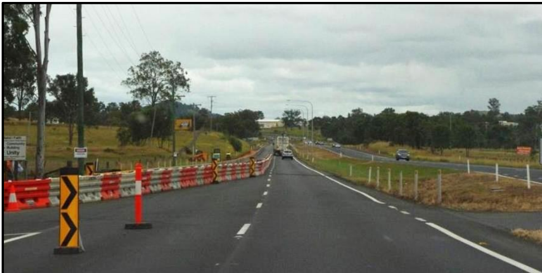
FIGURE 1 Photographs shown to drivers for obtaining self-nominated speeds (Top: Site 1, Bottom: Site 2).