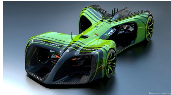
Figure 3. Robocar

very high on our agenda and we worked hard to merge the best performance with stunning styling.”