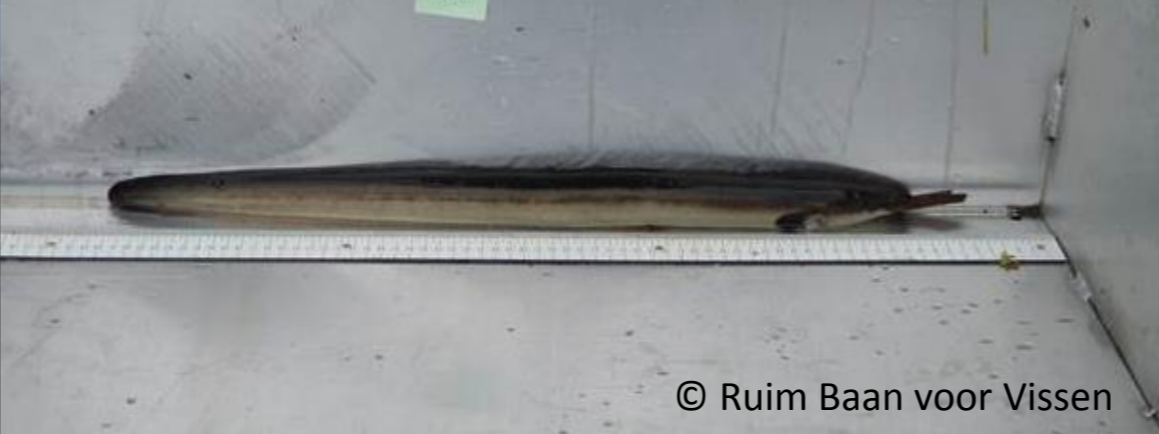
1 st detected Dutch eel 'Ali'