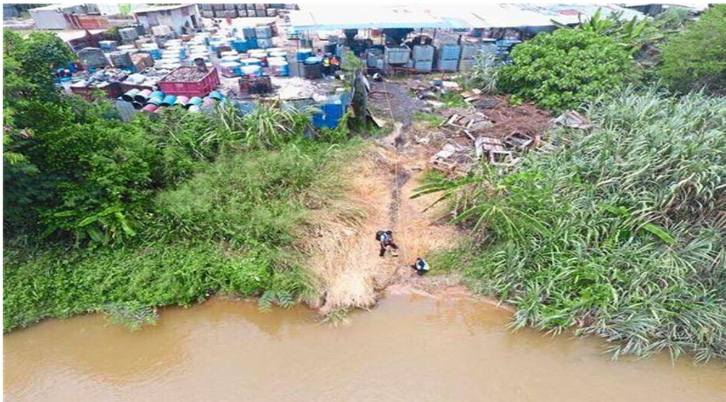
Figure 2: Pollution in Semenyih Tributary

Semenyih foul smell pollution case, the DoE claimed no responsibility for the point-source pollution as the pollutant originated from illegal factories and blamed the local government for not controlling the development of illegal factories. The federal and the state government had eventually stepped in and ordered all agencies to enforce their laws albeit their ‘not my jurisdiction’ claims (The Sun Daily, 2016). This case exemplifies the non-integration of pollution control and enforcement in the Langat River Basin (Fig. 2).