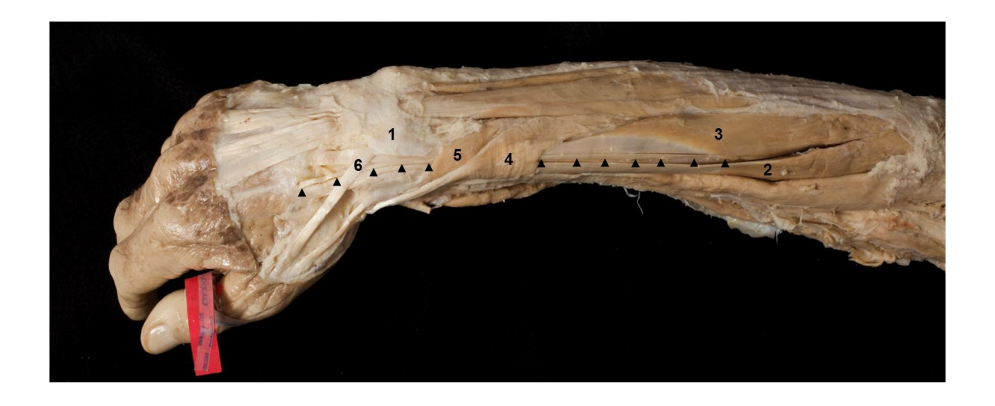
Figure 4. A. Cadaver D right ECRA; B. Left ECRA