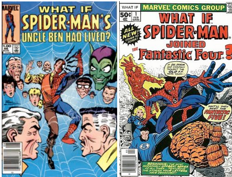
Figures 5 and 6

Will the real Spider-Man please stand up?