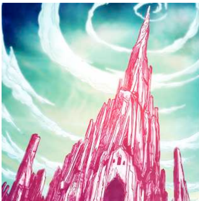
Figure 8: The Panoptichron

In the Marvel Multiverse, travel between quantum regions is usually rationalised by way of cosmological accident or special abilities rather than a simplistic pathway that can be travelled by all. In The Exiles , we have the Panoptichron, a crystalline structure that exists outside time-and-space where the vistas of the multiverse can be viewed and visited. We, as readers, exist in the Panoptichron, where we can survey the Marvel multiverse as a vast narrative network of complex design. Hypothetically, that is. For Reynolds, there is no single person -- on this plain of existence at least -- that has digested the entire contents of Marvel's many-worlds. However, in cyberspace, individual fans pool their vast encyclopaedic knowledge centres and collaborate to construct enormous databases of arcana. Websites, such as the Marvel/ Wikipedia database, operate as online reference manuals that are vast knowledge pools of collective intelligence, painstakingly constructed by fans and "super-readers." Cyberspace is an intricate branch of the Panoptichron whereby the multiverse and its rich expanse of narrative becomes accessible to all.