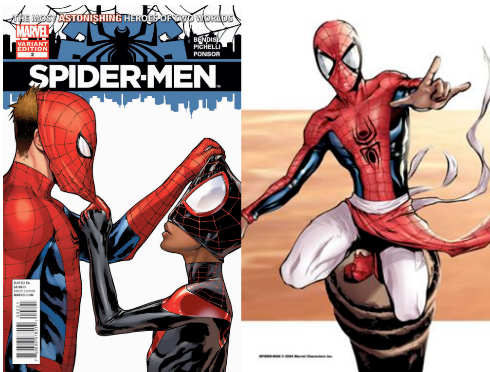
Figures 2 and 3

Earth-1610, the consequences of which shift the narrative parameters of the Ultimate Universe and leads the way for a re-launch of the imprint by shifting the status quo through whole-sale destruction. The Miles Morales-Spider-Man has survived and went on to lead The Ultimates – the 1610-version of The Avengers – in a new series that began in April 2014. However, following the events of Jonathan Hickman’s Secret Wars, the Ultimate Universe has been destroyed (although Miles Morales has successfully survived the cull and migrated to the 616).