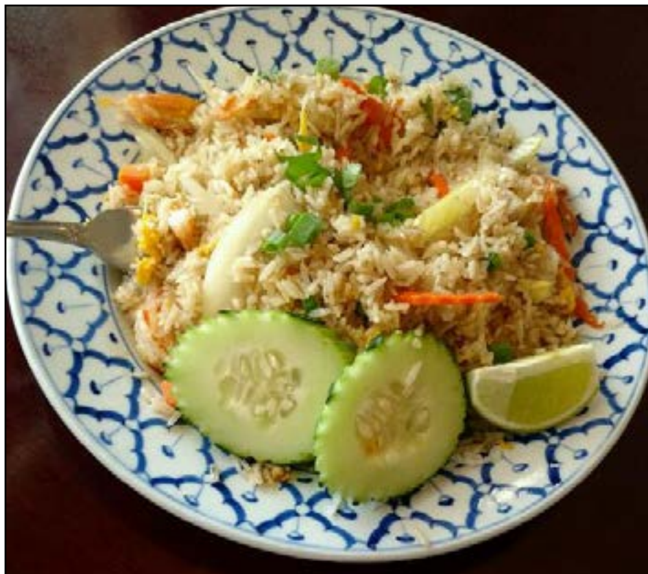
The shrimp fried rice, a delicious meal with the addition of tasty cucumber, to enhance the flavor up a bit.

Orchid Thai is open Monday through Thursday from 10:30 a.m. to 10 p.m., on Friday to Saturday from 10:30 a.m. 11:00 p.m., and Sunday from 11 a.m. to 10 p.m. Their location is 27266 Baseline St., Highland, CA 92346.