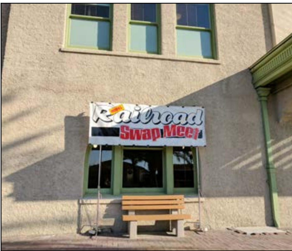
Amber Childress | Coyote Chronicle

"At these swap meets as a customer and hobbyist I am able to purchase the model trains that interest me while also