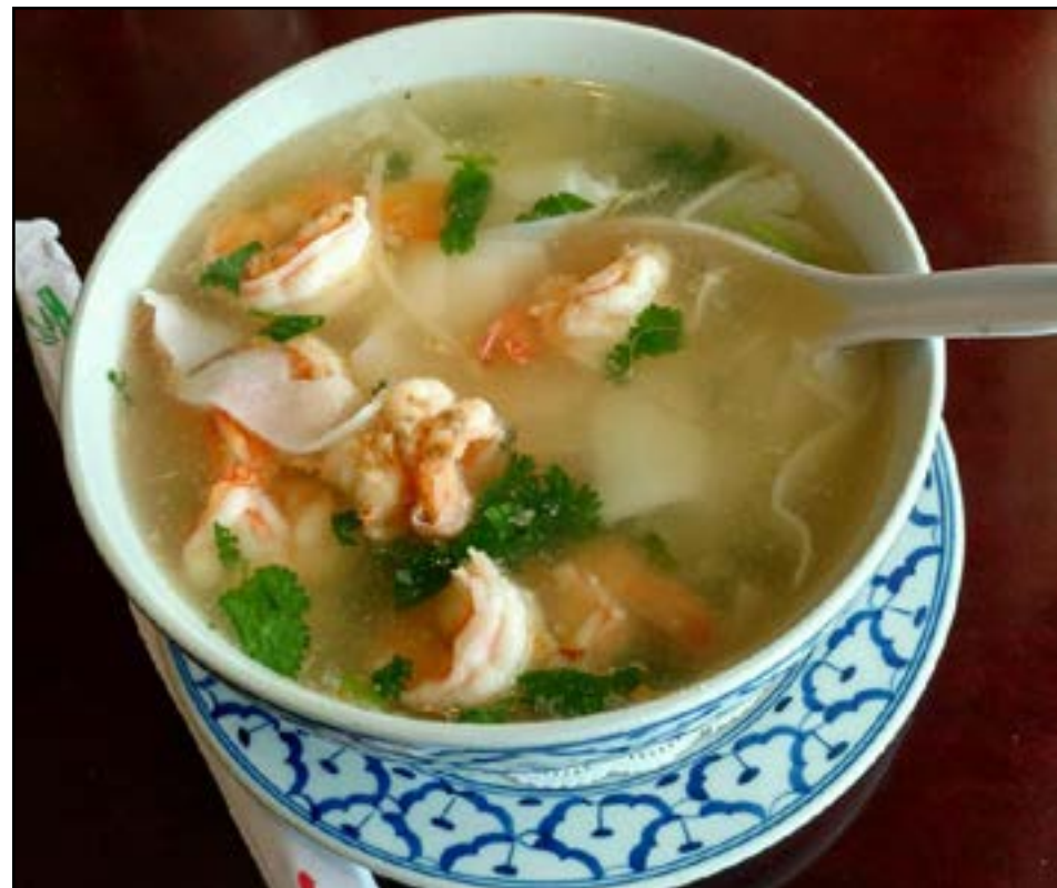
A savory shrimp soup featuring basil and noodles in a delicious broth.