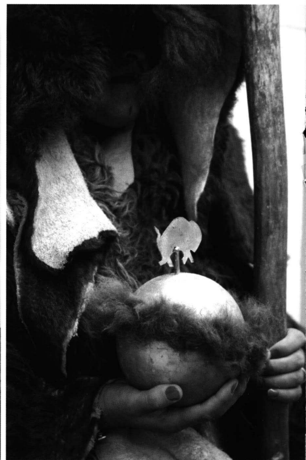
<left> Adrian Stimson. The Battle of Little Big Horn — Topping Old Sun , 2008. Photo: Jason Stimson. Courtesy: the artist. <right> Adrian Stimson. The Battle of Little Big Horn , 2008. Courtesy: Cheryl L'Hirondelle.