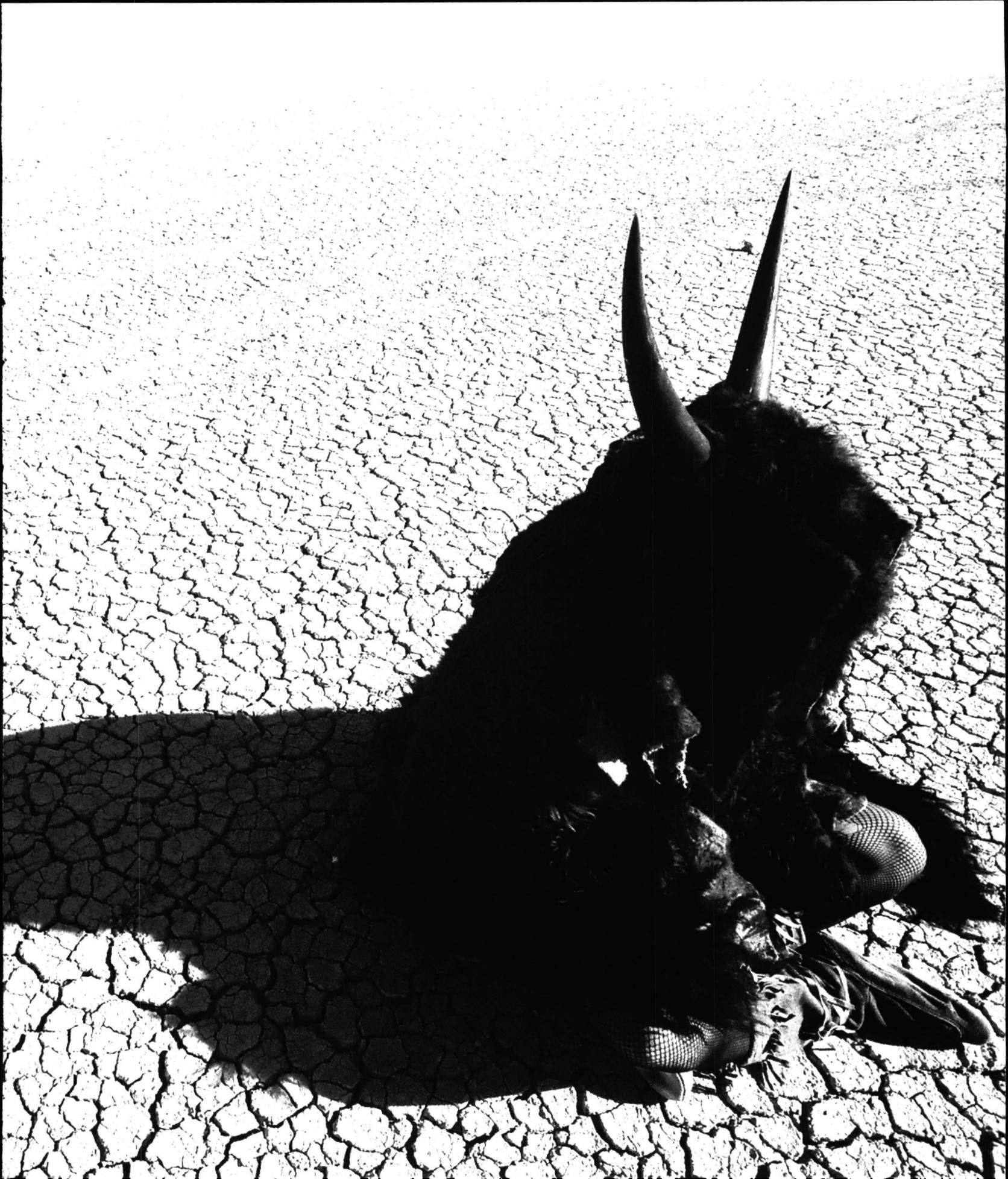
Adrian Stimson. Shaman Exterminator Sunrise 2 , 2005.