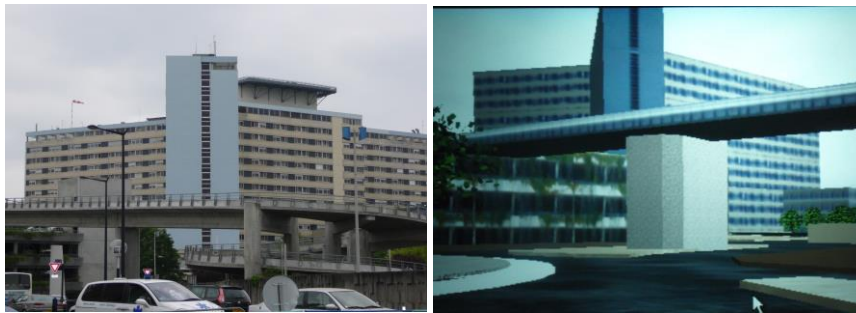
Fig. 1. Screenshots our real (left) and our virtual environment (right).

The real environment was a 9km 2 area. The VE was a 3D scale model of the real environment, with realistic and visual stimuli. The scale of the real environment was faithfully reproduced (measurements of houses, streets, etc.) and photos of several building facades were applied to geometric surfaces in the VE. Significant local and global landmarks (e.g., signposts, signs, and urban furniture) and urban sounds were included in the VE (see Figure 1). VE was laboratory-developed using Virtools Dev 3.5™. Irrespective of the interfaces conditions, the itinerary was presented to participants on the basis of an egocentric frame of reference, at head height. It was characterized by an irregular closed loop, 780 m in length, with thirteen crossroads and eleven directional changes.