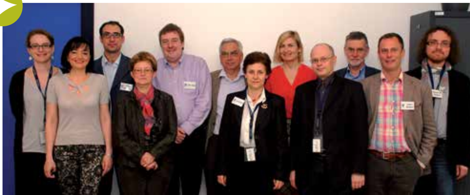
Members of the Science Europe Scientific Committee for Life, Environmental and Geo Sciences and the Research Affairs team, April 2013