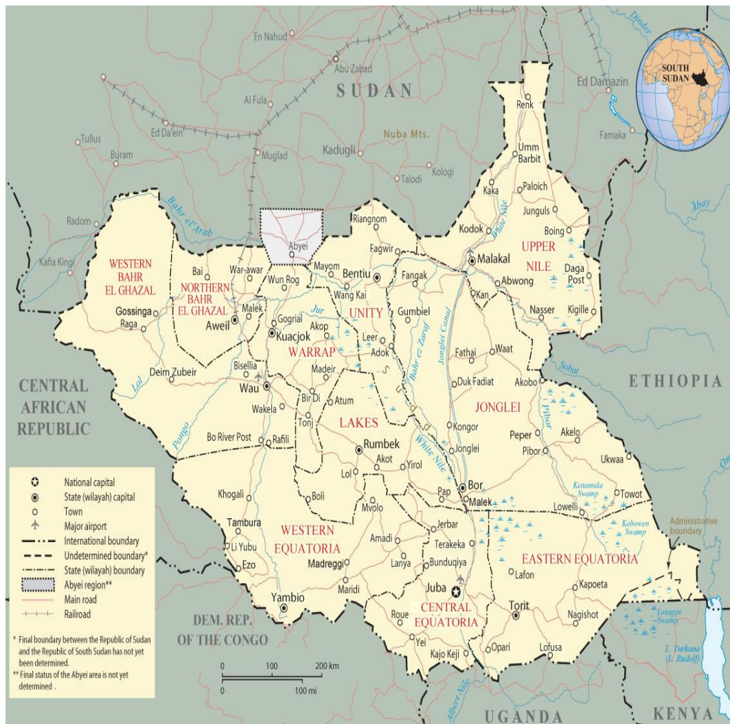
Figure 2. Republic of South Sudan Note. Source, United Nations