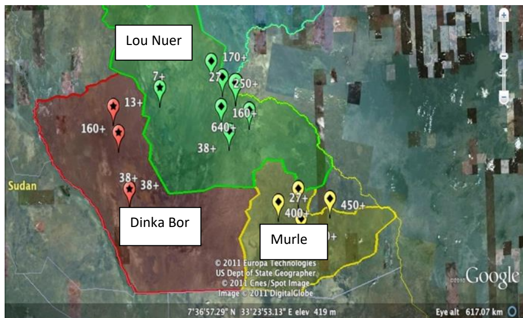
Figure 3. Jonglei conflict map Note. Source, Europa Technologies/US Dept. of State Geographer (2011)