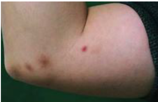
Figure 2: “Erythematous to brown nodules on the elbow and upper arm.” (Park 260)

The diseases mentioned above, such as TB and fungal infections, may develop fairly quickly after taking Humira. In addition, Humira can cause cancer, which most likely will not develop in susceptible patients until after the patient has ceased taking Humira. This is supported in a study in “Lymphomatoid Papulosis in a Patient Treated with Adalimumab for Juvenile Rheumatoid Arthritis,” by Park in which the researchers stated that “TNF- blockers [including adalimumab/ Humira] used to treat inflammatory disorders are also believed to reduce host immune responses to malignancy, thereby indirectly increasing the risk of secondary cancers ” (261). In Park’s study, he also found that “to date, data from several studies and case reports have shown an increased incidence of lymphoma in patients treated with anti-TNF agents” (259 ). These cases of lymphoma are supported by the NIH (2007) in their prescription data when they state, “Malignancies are seen more often than in controls, and lymphoma is seen more often than in the general population” (1), and further supported by the FDA who found that besides lymphoma, other cancer such as “basal cell cancer and squamous cell cancer of the skin [occur in the patient]. These types of cancer are generally not life-threatening if treated but “people with RA, especially more serious RA, may have a higher chance for getting a kind of cancer called lymphoma” (3196923).