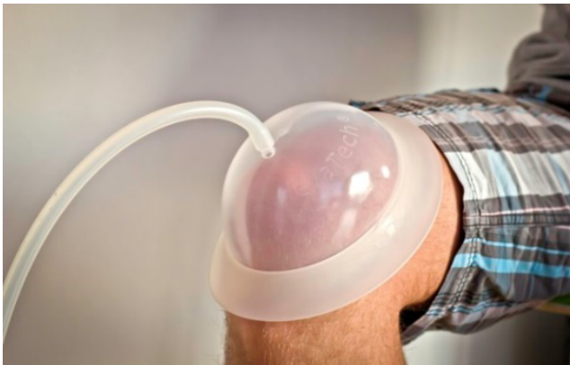
Figure 3: “Application of adaptable silicone cup at the knee” (Teut et al. 4).

According to M. Teut et al. in “Pulsatile Dry Cupping in Patients with Osteoarthritis of the Knee – A Randomized Controlled Exploratory Trial,” cupping also comes in two different forms, dry and wet. Today, the most common form, and the one used in this study, is pulsatile dry cupping. Pulsatile dry cupping “is a modernized technology using a mechanical device that generates a pulsatile vacuum with a pump,” when the vacuum is applied to the area that has pain with a cup (2).