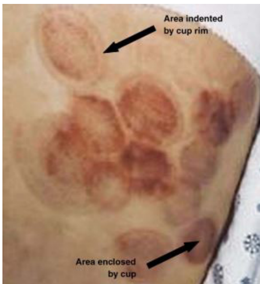
Figure 4: “Results of Cupping” (Tham et al. 2191).

Ecchymosis, a discolouration of the skin caused by the escape of blood into the tissue from ruptured blood vessels. This is a characteristic feature of the cupping treatment and takes the form of a circular lesion” (2192).