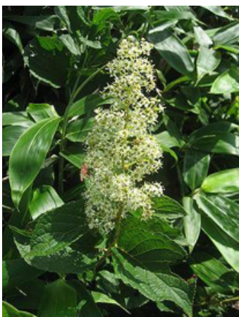
Figure 1. T. wilfordii (雷公藤, lei gong teng; “thunder god vine”)