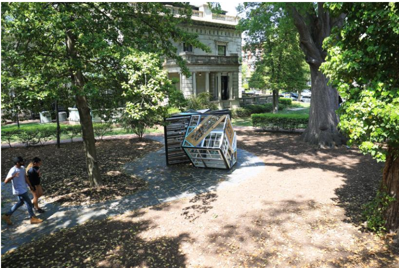
fig. 9 15