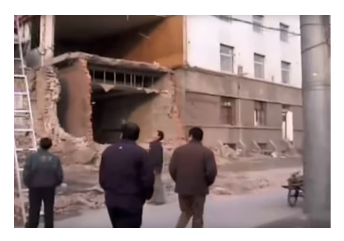
Figure 1.2 Pedestrians watching the demolishing of a building. Meishi Street (Ou Ning and Cao Fei, 2006)