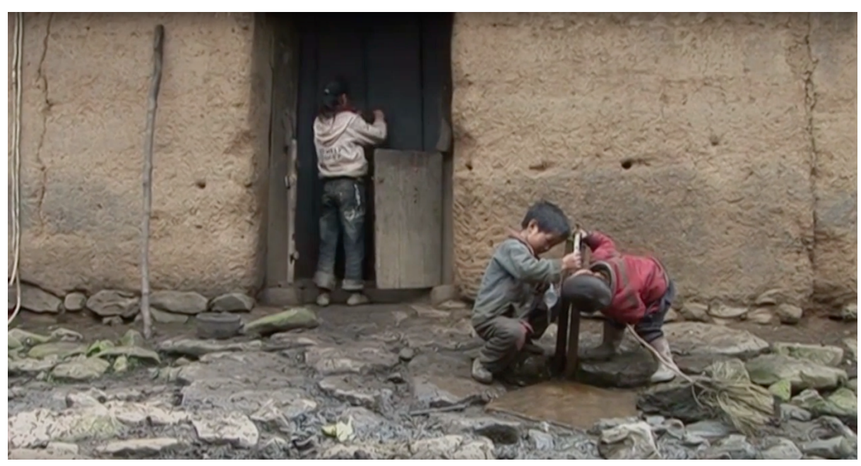
Figure 1.3 Three sisters in the front yard. Three Sisters (Wang Bing, 2012)