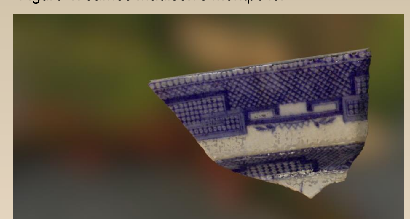
Figure 2: Blue Willow Rim, Virtual Curation Lab, VCU