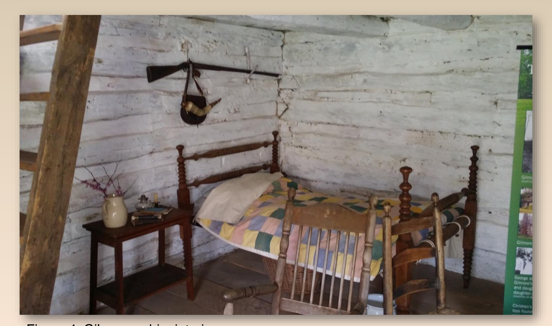
Figure 4: Gilmore cabin, interior

In the current economic system, labor is often forced through manipulation of employers, unpaid and underpaid work, physical and, or, mental labor not outlined or explicitly agreed upon. Members of the lower economic class, such as labor workers or unskilled trade workers are commonly susceptible to this treatment in the modern Western economic system (Yeoung 2013). In more extreme cases, individuals may be trafficked through physical force or intimidation and enslaved with no predictable chance of independence (American Civil Liberties Union 2017).