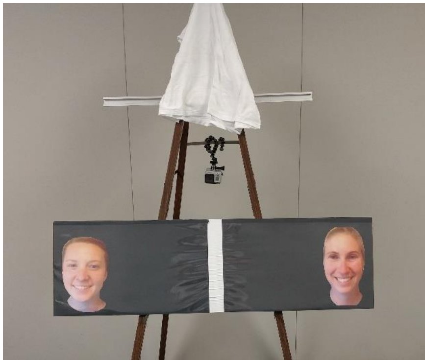
Figure 2.5 Experiment 2 Set Up

The procedure was similar to experiment 1, however, the worn t-shirt, rather than the actual keeper, served as the sample. The head keeper presented the shirt for the subject to smell at the start and middle of each session. After the initial presentation, the shirt was draped over the top of the easel. The photo boards for each trial were placed on the easel's ledge (see Figure 2.5). Halfway through the trials, the shirt was presented for smell and rehung before the next board was shown. Presentation order and reinforcement followed the same procedure as in experiment 1.