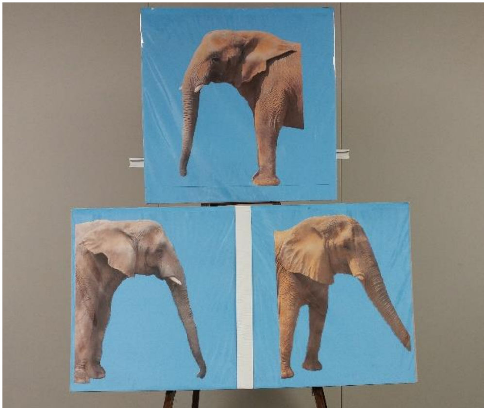
Figure 2.6 Experiment 3 Set Up

consisted of the two familiar elephants and were never of the elephant serving as the subject due to unknown self-recognition capabilities; it is possible that a photo of themselves would be unfamiliar. Sessions were procedurally conducted in a similar way to sessions in experiment 2; however, instead of the t-shirt being placed over the easel, a sample board was placed on top of the easel. The sample of the familiar elephant remained consistent over trials in sessions 1 and 2 (session 1: familiar elephant A as sample; session 2: familiar elephant B as sample). However, in session 3 the sample photo was changed over trials and was presented in a random and counter-balanced order so that familiar elephant A and B each served as the sample for 20 trials.