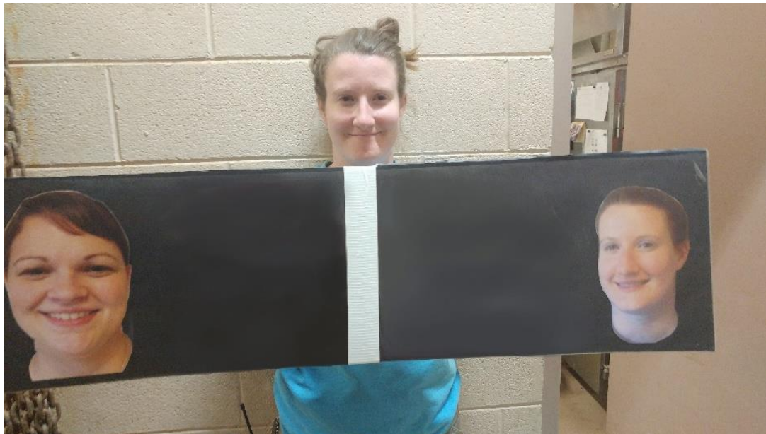
Figure 2.4 Experiment 1 Set Up

Experiment 1, matching a keeper to one of two photos, was conducted once elephants reached criterion. The apparatus now had two photos (see Table 2.1) and was held by a different keeper in each of three sessions (see Figure 2.4). The elephant saw two photos and was rewarded if they pointed towards the photo of the present keeper with their trunk.