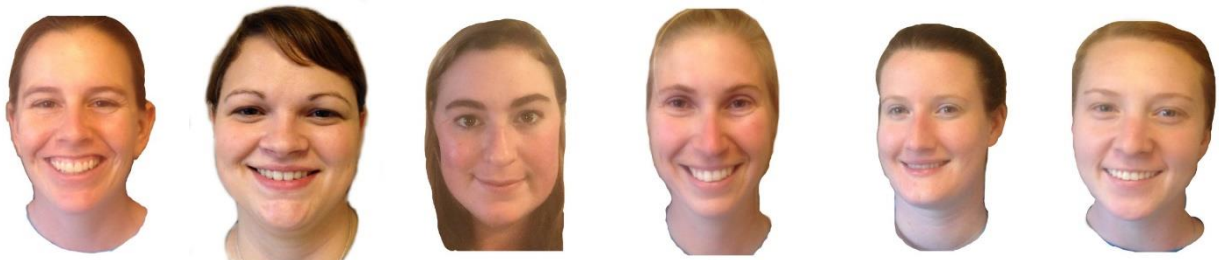
Figure 2.3 Keeper Photos

Photos of Zoo Knoxville's elephant husbandry staff were taken for human stimulus presentation. All six of the keepers are female and have worked with the elephants for multiple months. Keeper photos were taken against a plain background. All keepers smiled for the photo, wore no glasses on their face or head, and wore no identifying jewelry to ensure elephants were identifying the individual and not matching specific shapes. The photos were printed on 8.5 in. x 11 in. matte photo paper. Photos were trimmed to only consist of the keeper's face and neck and were then be attached to black poster board spanning the length and height of the apparatus (see Figure 2.3). The photos were positioned \frac{1}{2} in. from the left or right and 1\frac{1}{8} in. from either side of the photo apparatus to keep the faces in a constant position across trials.