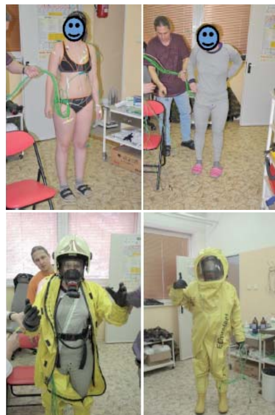
Fig. 3 Preparation of probands for measurement

Prior to testing in the climate chamber the probands were subject to a performance test, medical examination and they signed a form in which they were informed about the course of the testing. They were weighed, had pressure measured, attached sensors for measuring temperature and heart rate and were dressed into underwear and the chemical protective clothing. The progress of the respective steps is documented in Figure 3. The total weight of the chemical protective clothing, including breathing apparatus, was 25.3 kg.