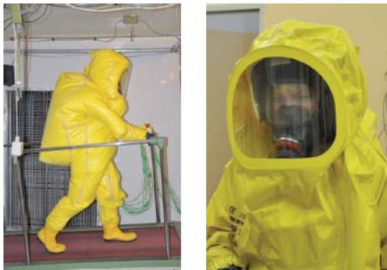
Fig. 2 OPCH 90 PO chemical protective suit and close-up of the visor

The suit is finished with integrated socks which slide into a pair of high boots which provides for dual protection of the feet. The boots have steel reinforcement in the sole and tip. The external cuff with elasticized end of the suit's leg is pulled over the boots to prevent liquids running into the boots, e.g. during contamination. The protective rubber gloves are not an integrated part of the suit (Kratochvíl and Kratochvíl, 2007).