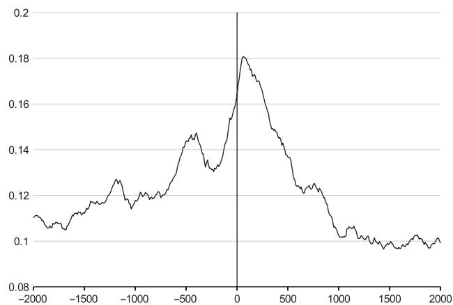
Figure 2 The average histone enrichment relative to transcription start site (TSS). The average histone enrichment relative to transcription start site (TSS). X-axis – the distance in base pairs (negative values represent upstream region) from TSS of known genes. Y-axis – the average enrichment by histones of all nine samples. Histone enrichment is the highest immediately after TSS. Another peak at -500bp from TSS indicates on gene promoter or enhancer regions. Only positions from 2000bp upstream to 2000bp downstream are shown for clarity.

and 41.8%, respectively). This indicates that histones are preferentially retained in GC-rich regions of the genome.