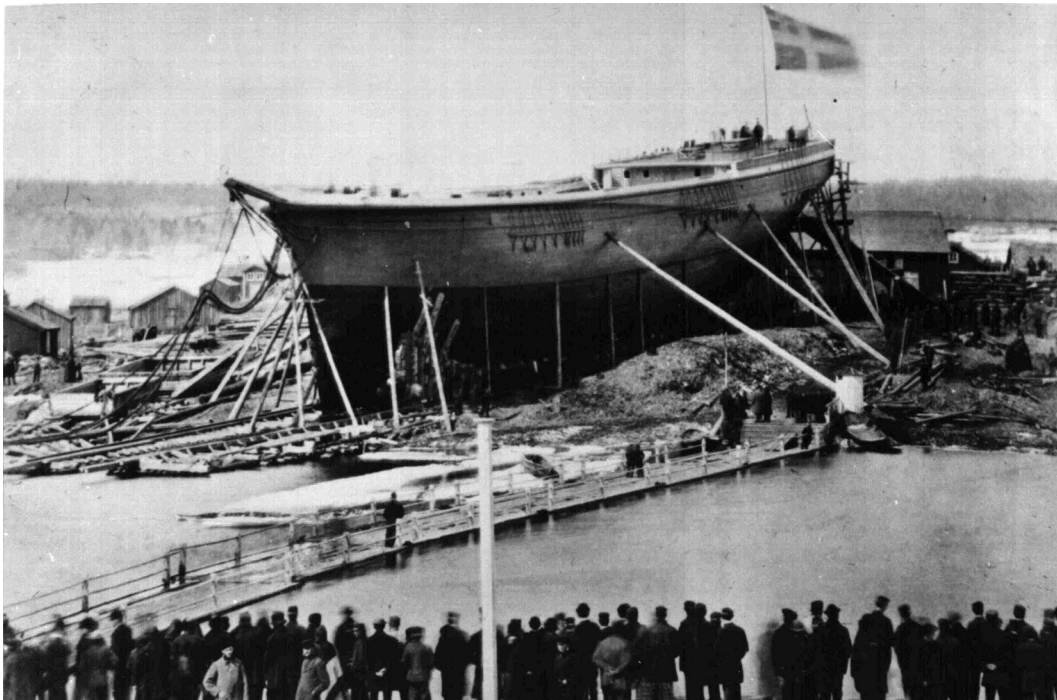
Figure 2. The ship “Föreningen” is launched in Härnösand in northern Sweden, early June 1867. The photograph was used in Ett satans år . The narrator points out that while it should be summer, snow is still on the ground and people in the foreground have on winter clothing “because it is still winter-time”. Thus, while the photograph does not directly show the famine, it is used as a visual source that demonstrates the cause for the coming failure of crops.

the story of Wallgren through re-enactments, it provided images with people in them. This will have been a key issue, because television norms demand that subjects are covered both through words and images. This is often a difficult norm to handle in historical television, because there are rarely authentic images of past events or people, unless the subjects have been rich and / or famous. In fact, there is a strong tendency for historical television to portray issues that have gathered a wealth of archival pictures, such as the Second World War which was widely documented by cameramen accompanying the troops. Similarly, royal families have always attracted photographers as well as painters and cameramen. For example, a very large share of the old film archive at SVT contains film depicting the Swedish royal family, which makes it easy to make historical television about the royals. 28 By contrast, few professional photographers were active in Sweden in the 1860s, and few of their photographs circulated or entered media archives. 29 Häger and Villius found very few historic images that in a direct way could represent the famine year, one of them a photograph taken in early June 1867 showing there was still snow on the ground. But none of these images depicted the starving poor or the harsh living