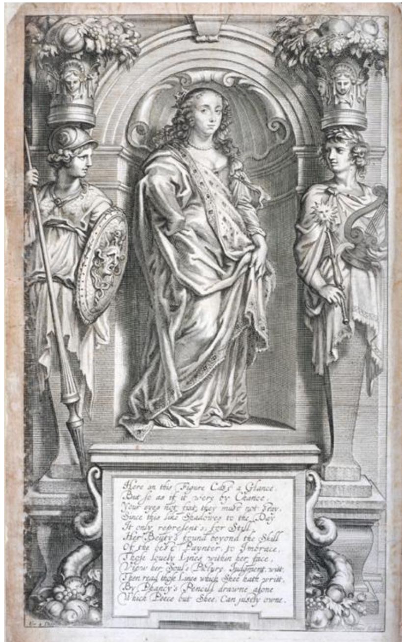
Figure three: Margaret Cavendish, Frontispiece from Grounds of natural philosophy (1668)

[21] However, Cavendish's opposition to microscopy was more thoroughgoing (and more interesting) than merely exposing its ineptitude in what it claimed and aimed to do. When she writes of exterior knowledge and interior knowledge, she does not mean what we can know from the outside and what we might like to know about the inside. Rather, she means what the exterior of an object knows and the different knowledge of the interior. Cavendish's world is vitalist; its matter is alive, aware and perceptive, even while that world is quite some distance, tonally and philosophically, from any kind of mysticism we might associate with vitalist thought. It is not infused with the divine, and if formally it constitutes panpsychism, it nevertheless has little sense of an anima mundi or a world electric with god. This makes for a curious reading experience that is the converse of the microscopists. Where Power, Hooke and Charleton produce baroque and elegiac prose, awe-struck empiricism at the intricacy of the universe, whose wonder borders on psalm-like prayer,