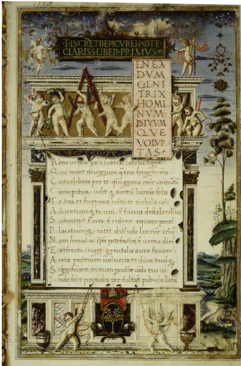
Figure two: Lucretius, De rerum natura , Vat. lat. 1569 fol. 1 recto medbio04 NAN.13