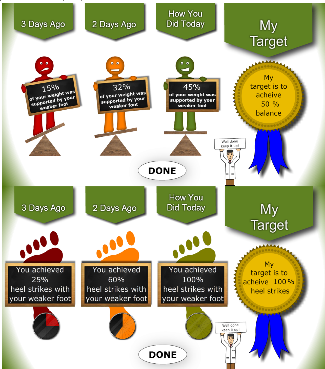
Figure 3. User feedback for symmetry and heel strike data from insole.

The theories to be validated through the realist evaluation process were generated through literature reviews together with empirical data collected in the earlier work [18,21,22]. These theories were then validated or refuted through individual and focus group interviews conducted with patients/caregivers and health professionals as described below. There were a number of theories that we wished to explore in this aspect of the evaluation; for example, the theoretical models of self-management rehabilitation that are amenable to technological solutions, the implications of motor behavior change mechanisms such as neuroplasticity and how they can be taken into account in technology development, and the extent