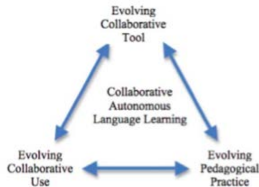
Figure 1 . A framework for the co-evolution of collaborative autonomous pedagogy (Kessler et al., 2012).

At the center of the learning context is the collaborative autonomous language learner—a learner who is able and willing to use language and appropriate communication strategies to “contribute personal meanings as a collaborative member of a group” as he/she negotiates the inherent tension between personal and group goals, where members also have their own priorities (Kessler & Bikowski, 2010, p. 53). Figure 1 displays the co-evolution of a collaborative autonomous pedagogy framework.