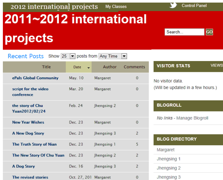
Figure 2. Screenshot of the class weblog

A class weblog (see Figure 2) was set up to facilitate teaching and learning in the course. The blog contained a collection of information and learning resources that gave step-by-step support to students as they completed their project tasks. Each group had its own individual blog within the class blog in which students wrote their project drafts and did peer-corrections. The researcher also answered students' questions and commented on students' work through the class weblog.