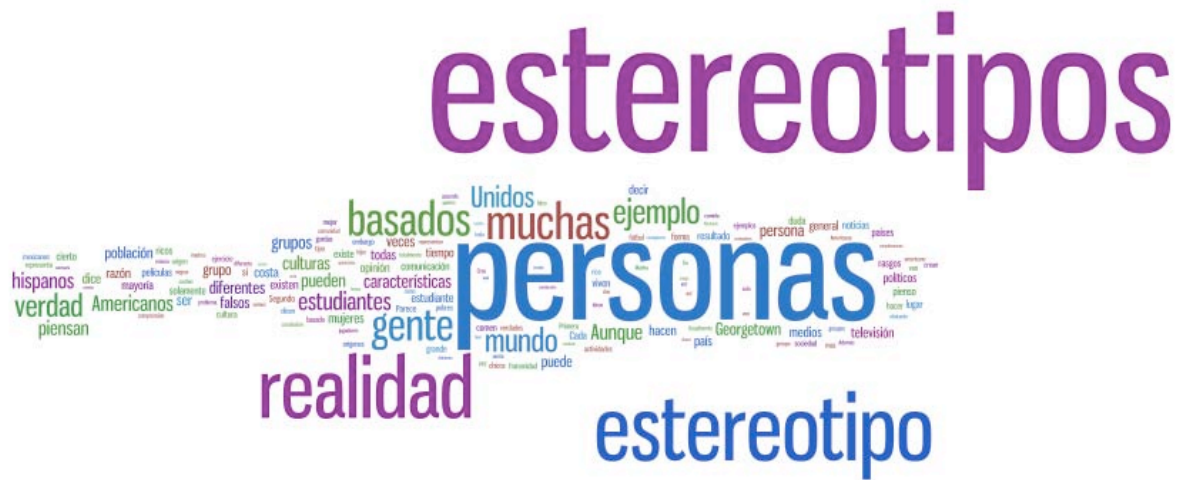
Figure 2. Students’ first wordle for draft one of composition two.

For the second composition, students were asked to submit their first draft to the instructor electronically. Using Wordle, the instructor then created a single wordle based on all the students’ compositions. During the next class meeting and writing workshop, the instructor showed the resulting wordle to the class.