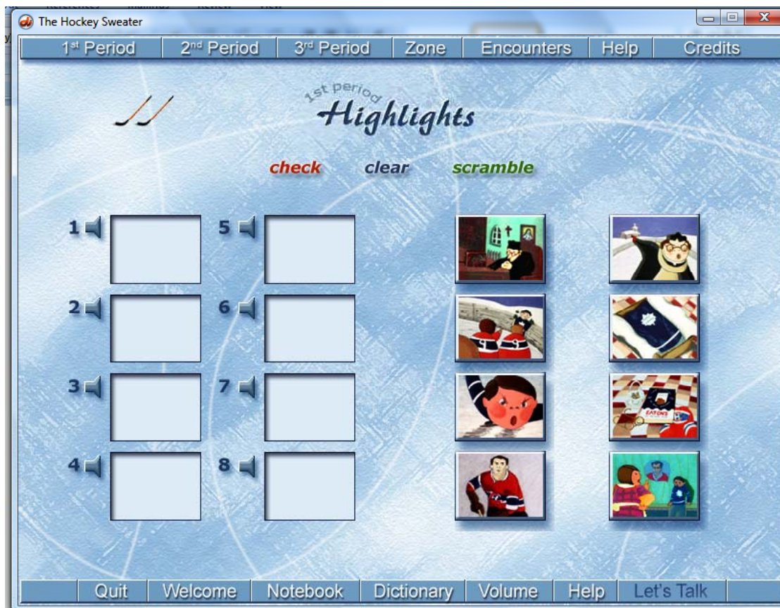
Figure 2. Sample activity with listening highlights of the video.