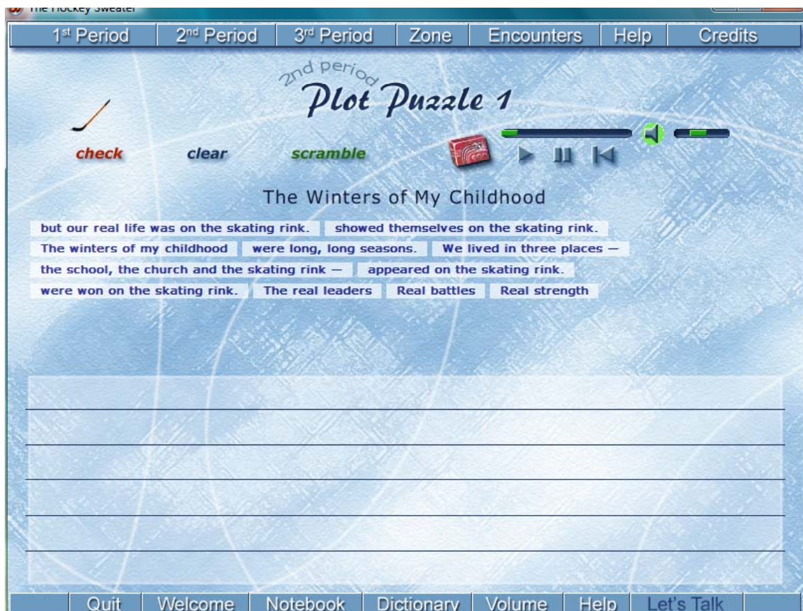
Figure 3. Sample Peewee level plot puzzle.