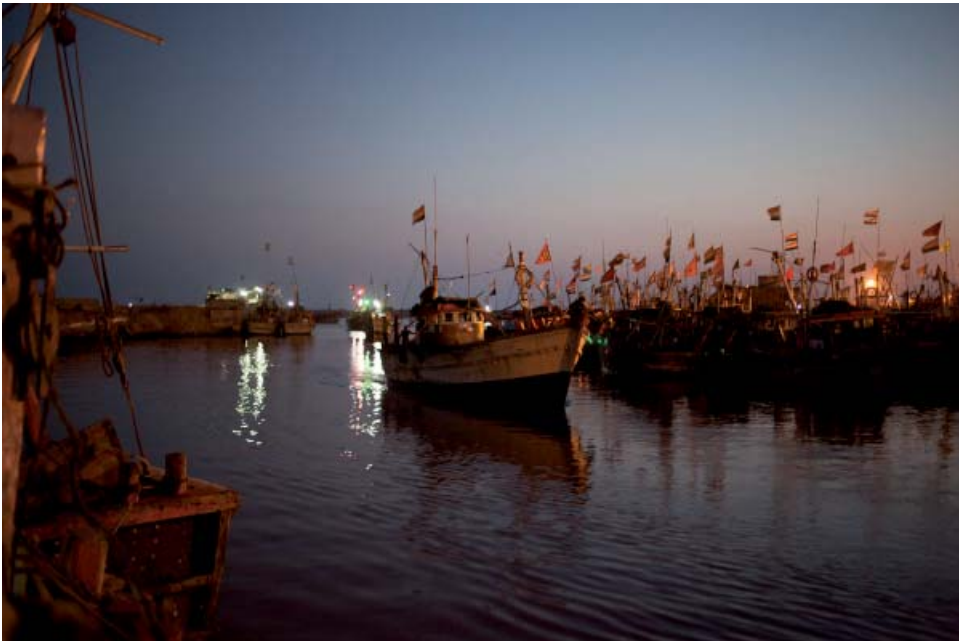
Fishing craft return to the Veraval harbour at dusk. There were 8,299 fishing craft registered with the Fisheries Department in Veraval.