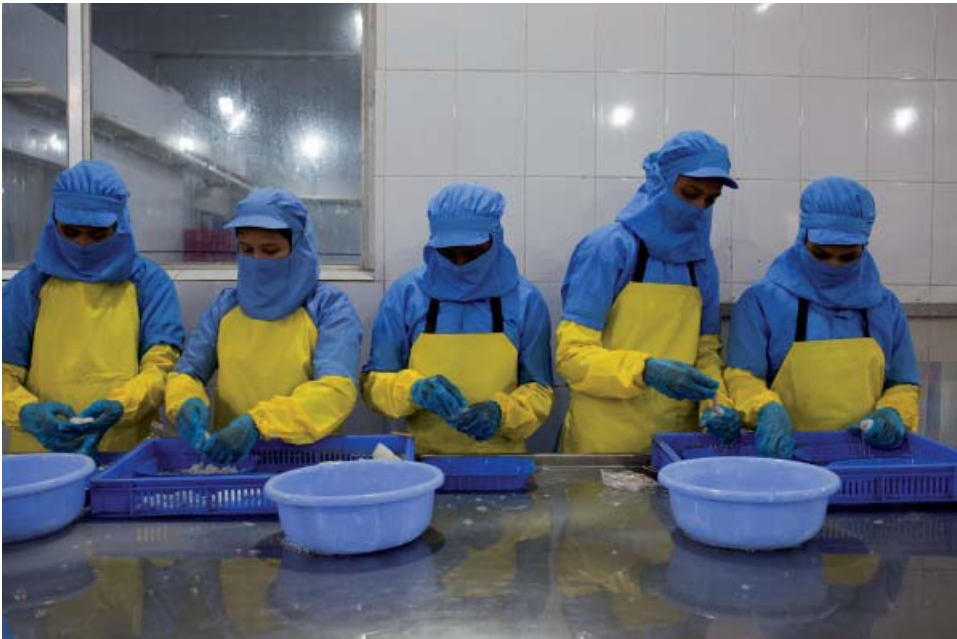
Women at work cleaning squid in a Jinny Marine factory in Veraval. Labour standards are much better regulated in the processing units, especially those exporting to Europe and North America, than in the fishing craft.