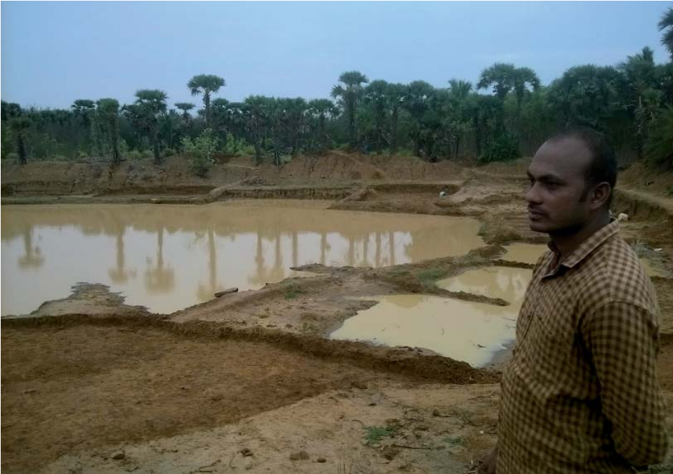
An NREGA site in Srikurmam, Andhra Pradesh where men and women earn up to Rs 150 ($ 2.5) for a day's work digging a pond to conserve rain water.