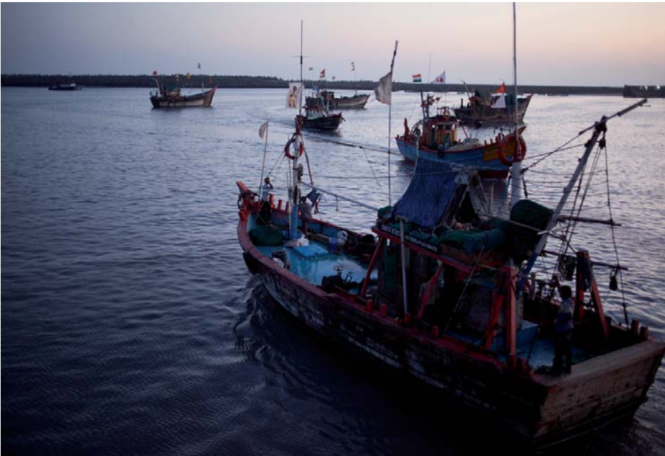
Trawlers depart from the Veraval harbour, Gujarat at dusk.