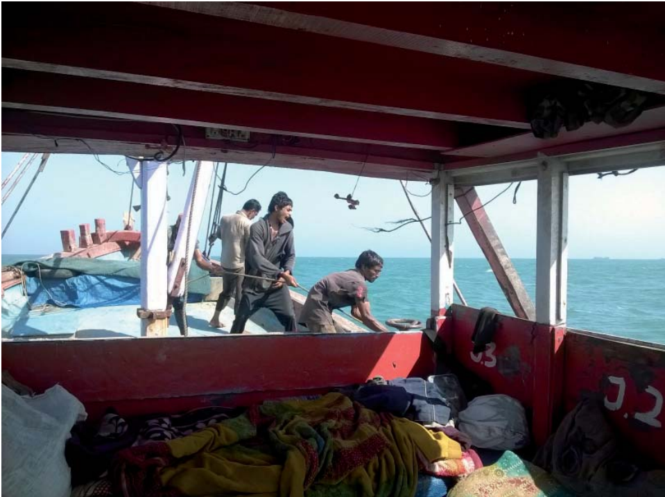
Migrant and local fishers always work separately to avoid fights.