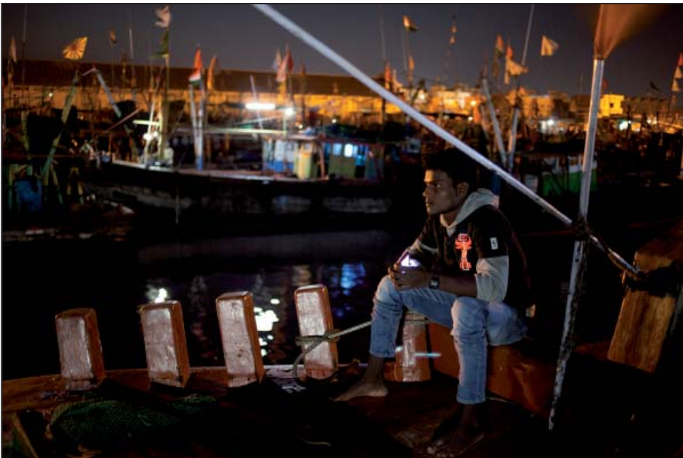
A young migrant fisher at the Veraval harbour. After 20 and 25 consecutive days at sea, the men touch shore for just one day before they set off again on the next fishing trip.