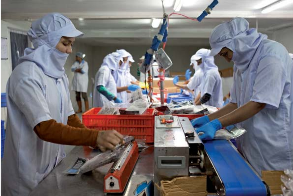
Women, mostly Gujaratis, form 90 percent of the labour force in the processing units. The products are packed and labelled for supermarkets in Spain, Portugal and Italy.