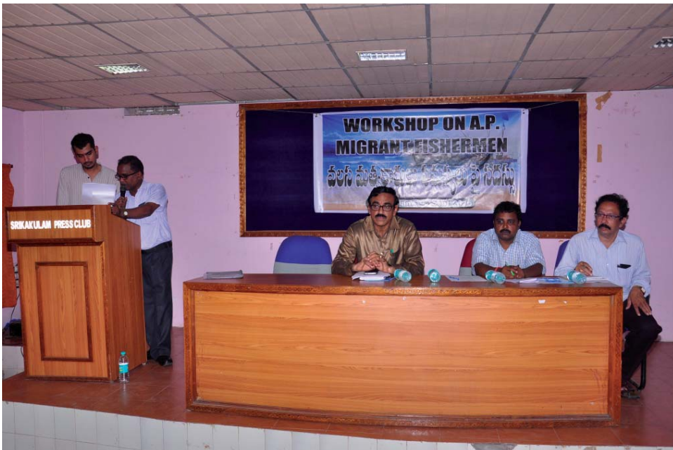
Workshop on Migrant Fishermen from Andhra Pradesh in the Gujarat Marine Fishing Industry, 14th March 2016.