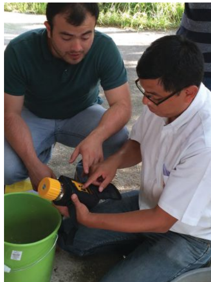
Testing a moisture meter with corn samples in Guatemala in collaboration with the SHARE team.

This effort is particularly important in war-torn Afghanistan, which once exported high-quality grapes, raisins, dried fruits, and tree nuts to international markets. Recently, receiving countries have rejected these high-value agricultural products because of fungal toxicities. Not coincidentally, many Afghans suffer from health problems that are possibly attributable to chronic exposure to mycotoxins.