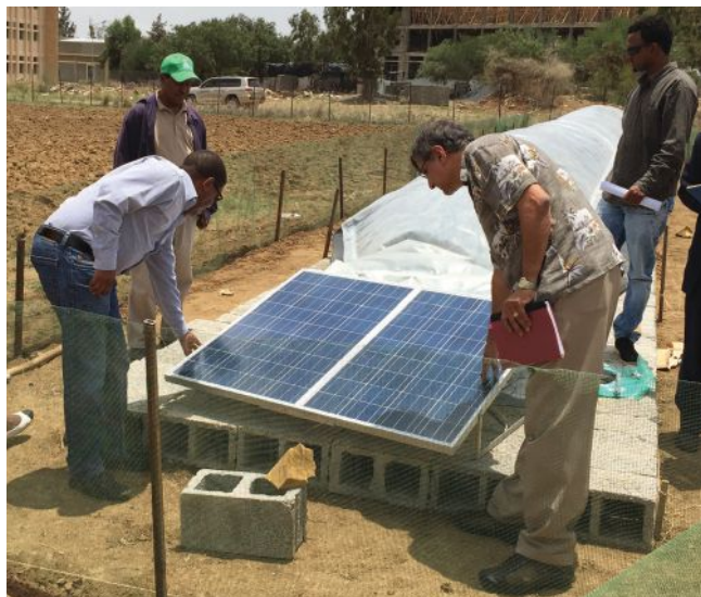
PHLIL team members install a Solar Bubble Dryer in Ethiopia.

Other PHLIL teams are training local staff in the four focus countries in the use of moisture meters. The Deere Foundation donated funds for the purchase of 40 handheld meters for measuring grain moisture on small farms, where crops often are harvested with high moisture content. These accurate, portable meters are an example of an on-the-shelf technology that can be applied immediately to reduce post-harvest losses for poor farmers in rural areas.