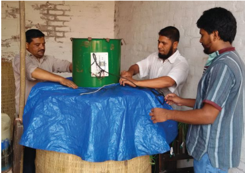
A professor and students at Bangladesh Agricultural University set up an STR dryer for rice.

In Guatemala, the promoters of this program are representatives of our in-country partner organization, SHARE Guatemala. They live in designated Feed the Future areas and are responsible for collecting and submitting grain samples for analysis. Through training and systematic sample collection, the promoters and participant farmers become more aware of moisture management during storage.