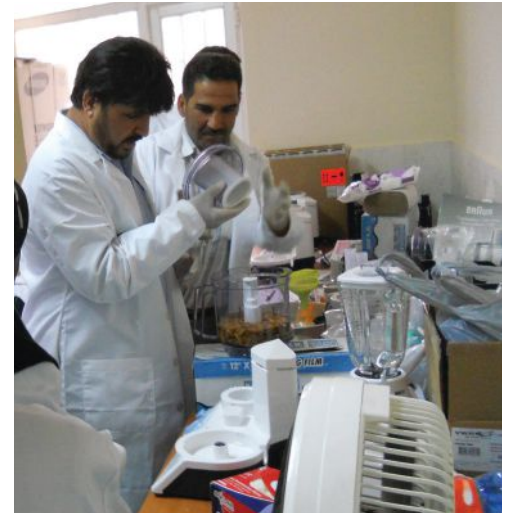
Staff members at the Afghanistan Ministry of Agriculture, Irrigation, and Livestock prepare a sample of raisins for mycotoxin analysis in the lab refurbished and equipped by PHLIL.

Africa RISING and SPRING will help the Ghana team collect mycotoxin baseline data. Additional pest infestation data from the warehouses and on-farm storages will be collected by ATT and SPRING. Large-scale adoption of ZeroFly storage bags (made by Vestergaard Frandsen) will be a collaborative process between the PHLIL team in Ghana and ATT, Africa RISING, and SPRING. The Ghana team has also received a $40,000 grant from the USDA Scientific Cooperation Research Program to build a biomass hybrid solar dryer. The Adventist Development and Relief Agency (ADRA) in Ghana is scaling up as well.