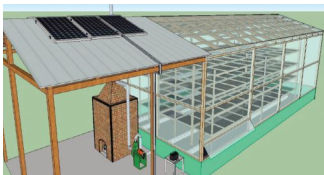
Schematic diagram of a biomass hybrid solar dryer in Ghana.

A great idea for drying grain in developing countries is the Solar Bubble Dryer, a polyethylene capsule powered by sunshine. Solar drying is economical and sustainable; however, lack of sunshine, high humidity, inconsistent temperatures, and longer drying times are challenges for small-scale farmers. To overcome these challenges, the PHLIL team in Ghana has developed a biomass hybrid solar dryer in which a biomass-fueled heater supplements the solar heat. The biomass fuel can be agricultural residue, wood waste, vegetable waste, or other combustible material. Tests are underway, and the results look promising. Up to five tons of maize can be dried within eight hours, reducing the moisture content from 25% to 12%. Future plans include gas-assisted solar dryers