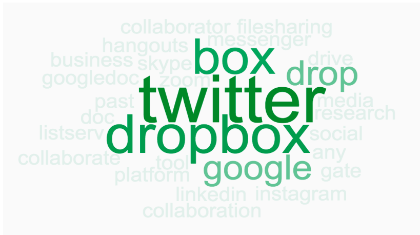
Figure 2: Other social media platforms used for professional networking and collaboration purposes

8% of the survey respondents indicate that they are also on other social media platforms for professional networking and collaboration purposes. A word cloud analysis was conducted on their responses. Font size correlates with the frequency that certain social media platforms were mentioned by the survey respondents. Error! Reference source not found. indicates that Twitter and Dropbox are also professional networking and collaboration social media venues that many survey respondents have on their favorite list. Other social media platforms used by some survey respondents for professional purposes include: listserv, Research Gate, Skype for Business, Google Hangouts, Instagram, Messenger, Zoom, Box (a paid filesharing platform).