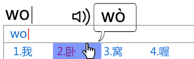
Figure 3. After a two second delay students are supported via audio pronunciations of any character option they consider.

hovering over it (Figure 3). The use of this type of aural support connects with our interest in enabling the learner to make use of what they know in building new knowledge and understandings. In this way users can anchor new understandings about characters in their developing ability to differentiate tones and identify when two or more character options are homophones. If the learner is able to discern their intended character via this support, they can click the character and enter it into their text and move on to the next word.