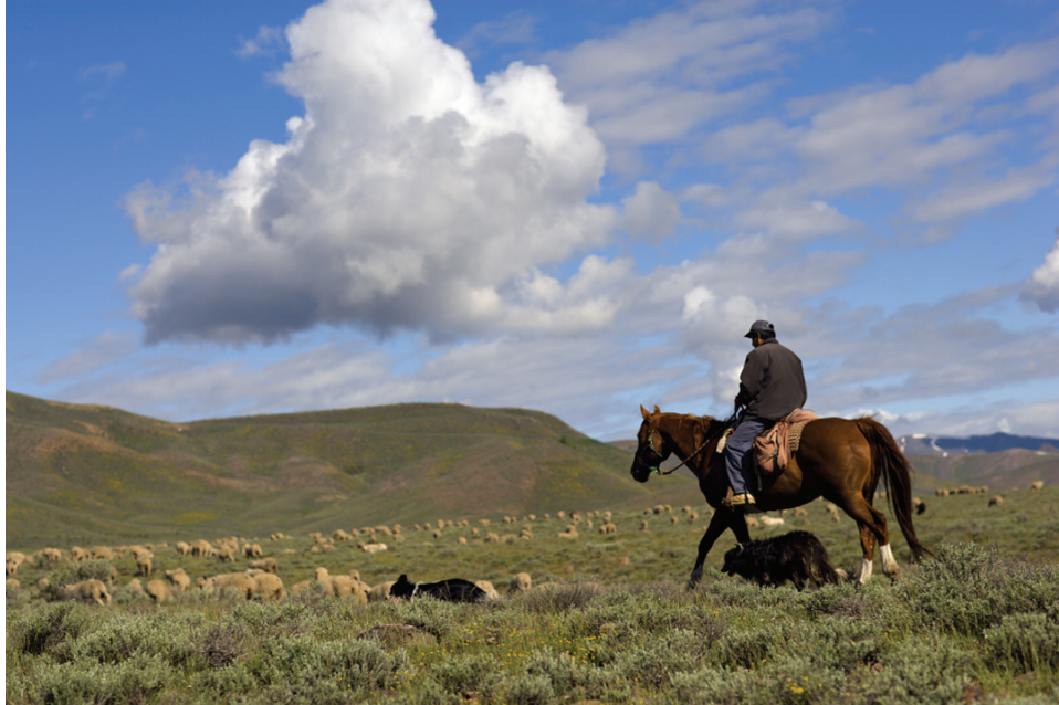
Fig. 1. —Lava Lake herder and herding dogs among the sheep.

unprotected areas, though the sheep are counted during shipping and at the end of the grazing season, which makes this scenario unlikely.