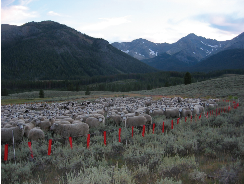
Fig. 3. —Lava Lake sheep in fladry.

There was a total of 240,000 sheep in Idaho in 2011 and, according to producer estimates, wolves killed 1,300 statewide (or 1 out of every 184 sheep statewide—United States Department of Agriculture – National Agricultural Statistics Service 2013). In 2012, there were 235,000 sheep in Idaho, and wolves reportedly killed an estimated 1,400 (or 1 out of every 167) sheep statewide. The National Agricultural Statistics Service reports on self-reported estimates obtained from producer surveys, which primarily represent unverified losses. However, they are the only measure beyond minimum confirmed depredations reported by state or federal agencies that provide even a rough estimate of total livestock losses. Statewide, 576 wolves were killed in response to livestock depredations from 2008 through 2014 (United States Fish and Wildlife Service et al. 2016).