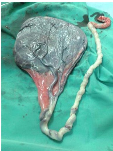
Figure 2: Placenta with velamentous cord insertion

A healthy baby boy weighing 3.4 kg was born with cord pH of 7.32. Velamentous cord insertion with vessels, approximated 10 cm in length, traversing in between the membranes was observed (Fig. 2).