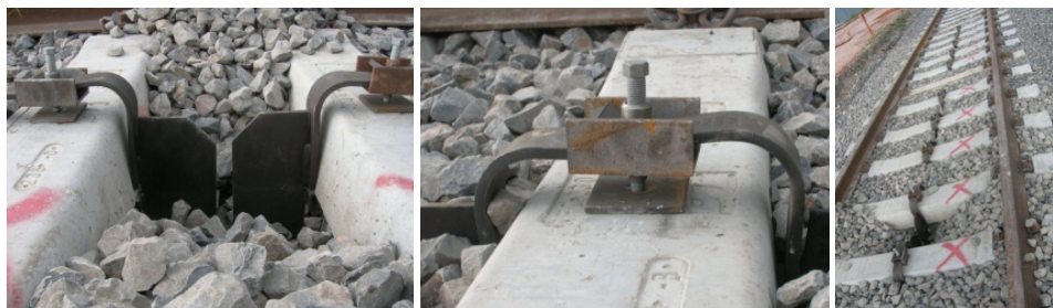
Figure 8: Shovels installed on the sleepers.

The last two scenarios have been constructed with a cant equal to 16 cm in respect to the rail level of all previous scenarios (Fig. 7). Later sleeper anchors have been installed on the sleepers (Fig. 8).