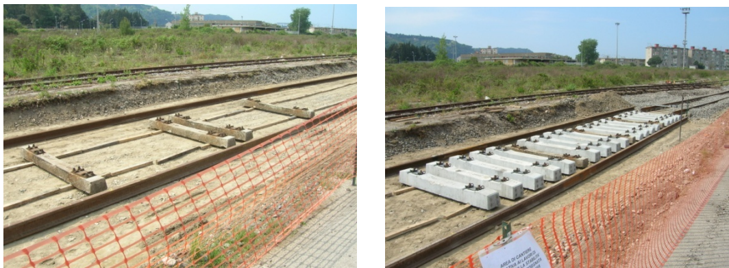
Figure 4: Positioning of buffer sleepers (left) and other sleepers according to the layout (right).