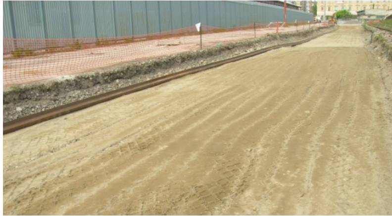
Figure 3: Excavation for the construction of the test track on the chosen site.

After the sleepers positioning and the fastening system tightening, the ballast has been laid (Fig. 6, left) and subsequently settled using the tamping machine, which lifts the track for packing the ballast under the sleepers. Also, during the lifting, the driver controls the position of the rails using the “telescope”, assigning the lateral movement to the rails, which is needed in order to ensure the required alignment, by means of a hydraulic system. The final height has been reached by lifting the track step by step.