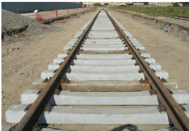
Figure 5: Rails fastened on the sleepers.