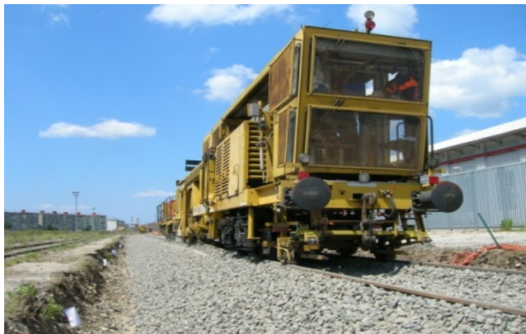
Figure 7: Construction of scenarios with cant.

During the ballast deposition and the related increasing of the height of the track, the universal ballast distributing and profiling machine with shoulder ploughs has been also used (Fig. 6, right) in order to remove the ballast in excess and obtain the desired shoulder shape.