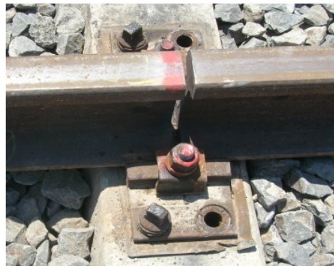
Figure 10: Cut performed by disk saw.

These discontinuities don't limit the movement of the rolling stock on the track, because the underlying sleepers are equipped with K fastening systems, which allow restoring the rail continuity by the u-bolt plates tightening (Fig. 10).