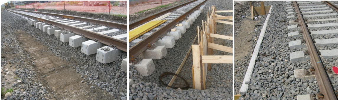
Figure 9: Ballast wall constructed in situ .

Once the elements characterizing the various scenarios have been prepared and before the ballast settlement of the sections for which it has been foreseen, the rails have been cut in correspondence of the end sleepers or the transition sections among groups of consecutive scenarios different in height and/or in ballast compaction. The sectioning was needed in order to reduce the rails free expansion length and to prevent that the temperature variations would alter the desired configuration of the test track. In particular, the cuts have been performed by disk saw and have left a clearance of roughly 1.0 cm (Fig. 10).