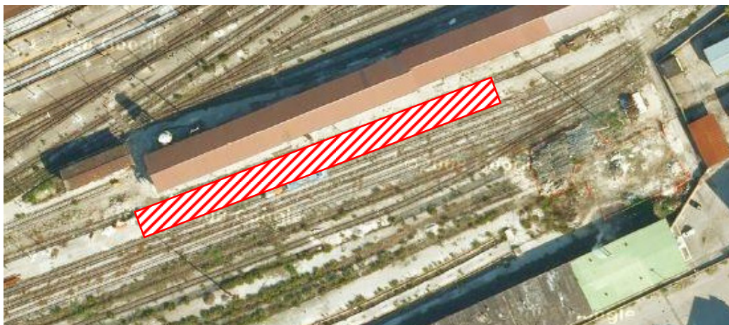
Figure 2: Top view of the selected site.

For the construction of the test field, it has been used an area of the Campi Flegrei Railway Station (Fig. 2) in Naples (Italy), removing a section of roughly 200 m of two old adjacent tracks and rebuilding a new one having the characteristics defined in the design of the 28 scenarios under testing.