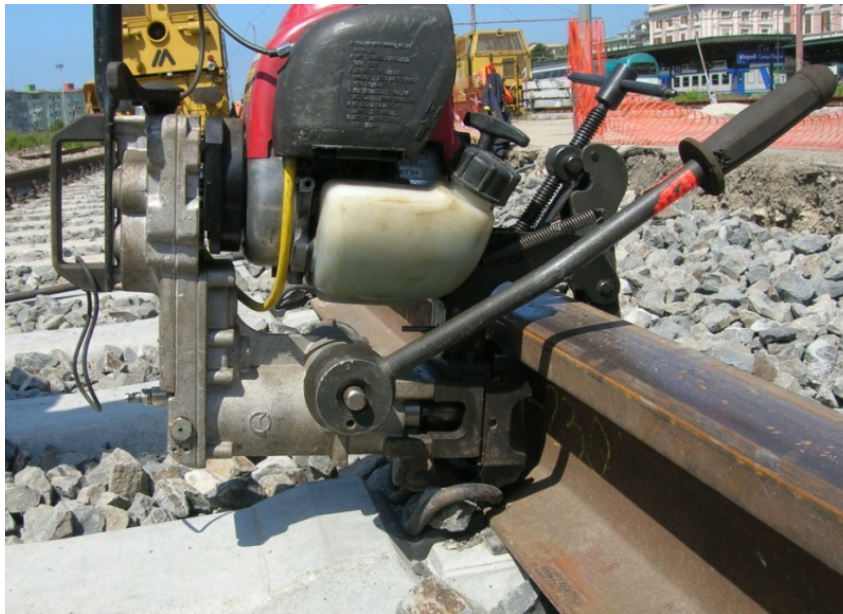
Figure 12: Drilling of the rails.