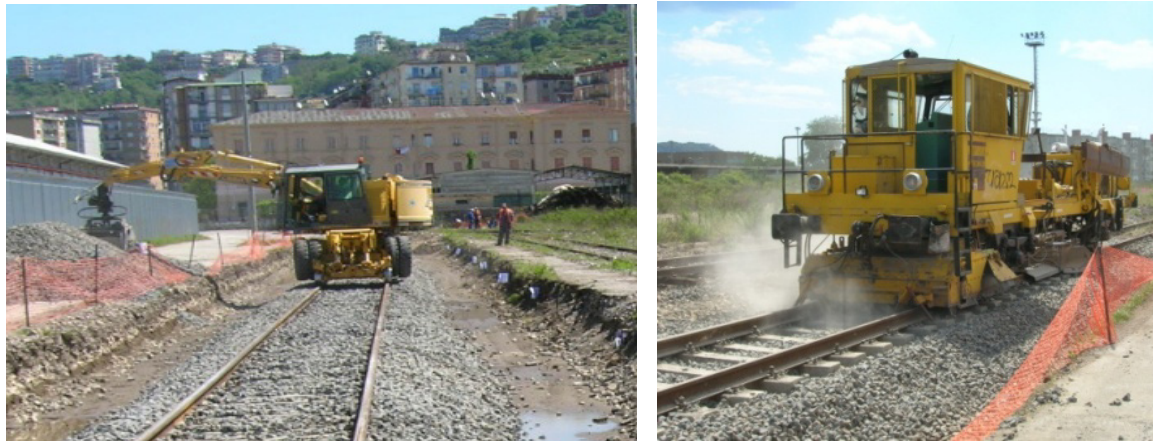
Figure 6: Deposition of the ballast (left) and removing of the excess (right).

During the ballast deposition and the related increasing of the height of the track, the universal ballast distributing and profiling machine with shoulder ploughs has been also used (Fig. 6, right) in order to remove the ballast in excess and obtain the desired shoulder shape.