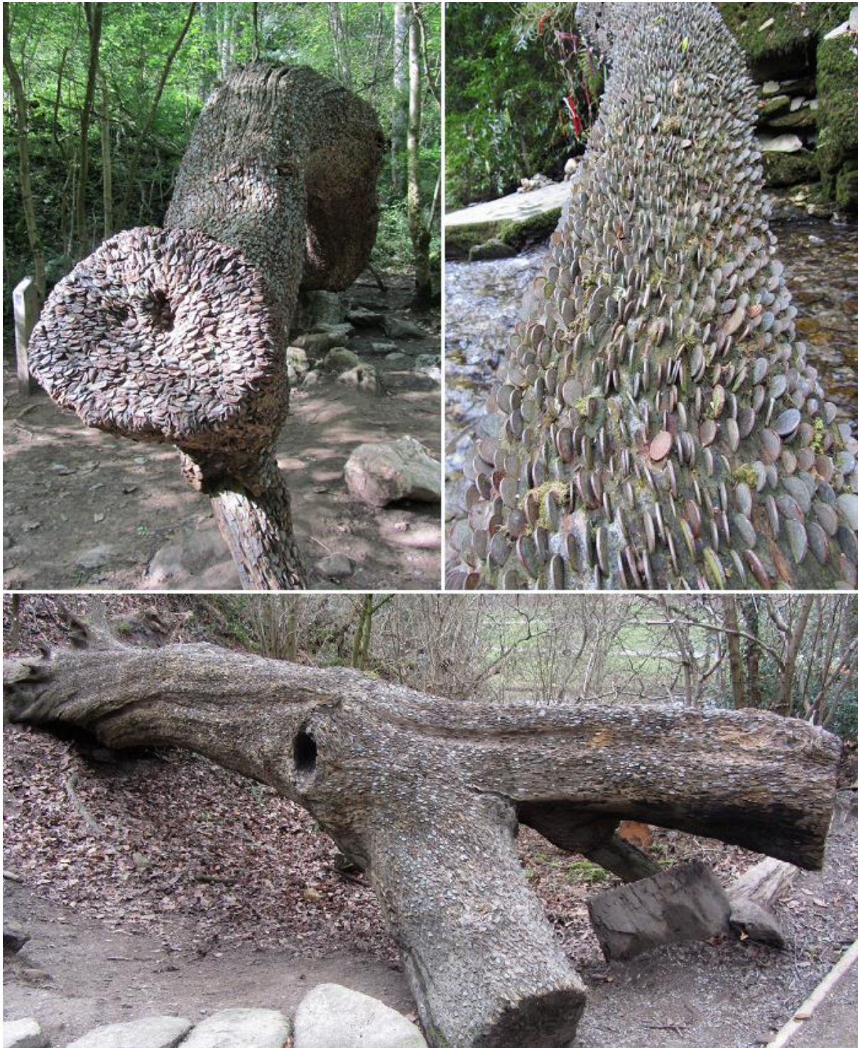
Examples of contemporary British coin-trees. Top left: Ingleton, Yorkshire. Top right: St. Nectan's Glen, Cornwall. Bottom: Bolton Abbey, Yorkshire