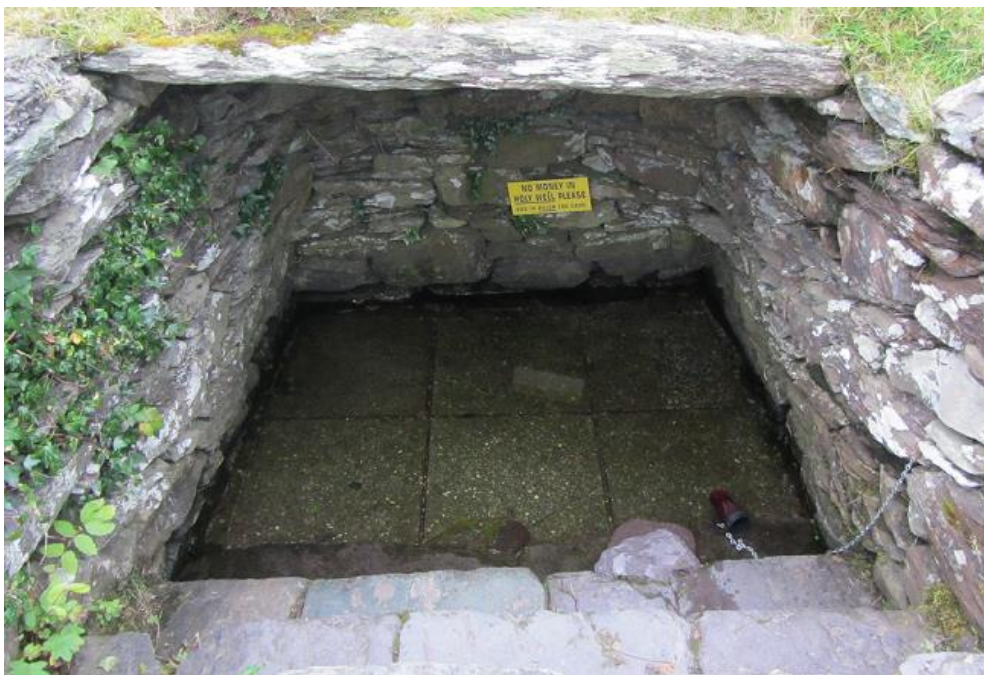
Sign discouraging the deposition of coins at St. Finbarr's holy well, Gougane Barra, Co. Cork