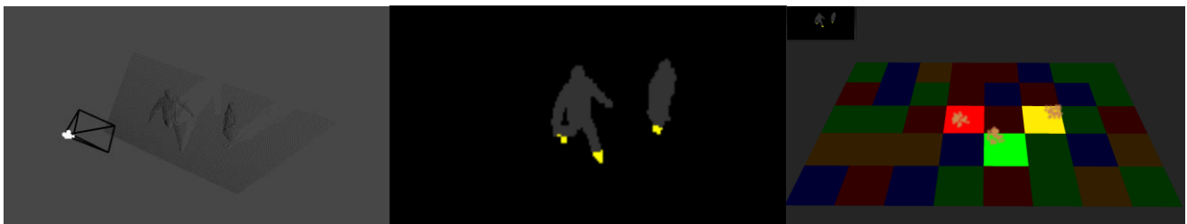
Figure 3: Left: Depth map rendered. Center: Feedback detection with grouping points of interest near the floor surface. Right: Player feet positions projected onto interactive surface.

The system is based on the Google Tango 3 device which is used for tracking player movements as well as rendering the game graphics. Presently the system is limited to projections on horizontal planar surfaces where the system currently only tracks players' feet (see Figure 3). While the Tango point cloud detection is limited on average to 10 FPS, more responsive detection is done by tracking feedback zones inside the captured image using Tango's rgb camera. The system distinguishes between players through colour tracking, hence in the current version unique footwear colour is required in order to play a multiplayer game. The tracking system utilizes depth camera and colour based tracking techniques. In order to enable easy integration with new and existing games, a decision was made to make our system compatible with Unity game engine and offer our player tracking and game projection solution as a Unity template better know as Unity prefab 4 . We decided on this in order to enable easy integration when modifying existing or creating new games that are compatible with our platform.