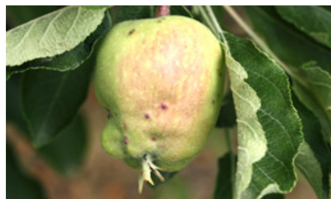
Early season feeding on apple fruits by nymphs results in corky bumps and sometimes fruit distortion.

The campylomma bug (or mullein plant bug; Hemiptera: Miridae) causes sporadic damage in Utah apple orchards. Damage is inflicted by nymphs, which feed on developing fruit causing dimpling and fruit distortion. As apple fruits mature, they become less susceptible to campylomma injury. Injury appears shortly after petal fall as small corky areas alone or small corky areas surrounded by a depression. Golden Delicious is typically more susceptible to damage than Red Delicious. Pear fruit rarely suffer damage, even at high campylomma populations. Campylomma overwinter as eggs laid in the young twigs of apple, pear and other rosaceous plants. These eggs begin hatching in the spring at about pink stage of apple bud development. This insect has three to four generations per year. A portion of first generation adults migrate from orchard trees to herbaceous weeds, particularly common mullein. However, campylomma can be found in apple and pear orchards throughout the growing season. Late nymphal stages and adults are beneficial predators of aphids, mites and pear psylla. In late summer through fall, adults will migrate into orchards to lay overwintering eggs.