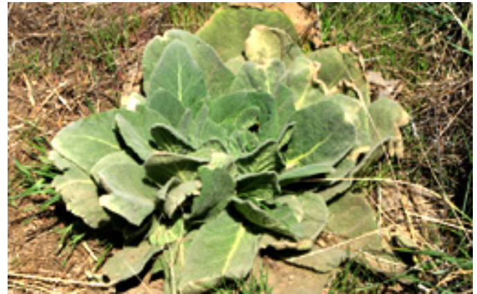
Common mullein is an attractive herbaceous summer host for campylomma.

The arrow indicates the time of year when monitoring of nymphs should occur on apples (PK = pink, PF = petal fall)