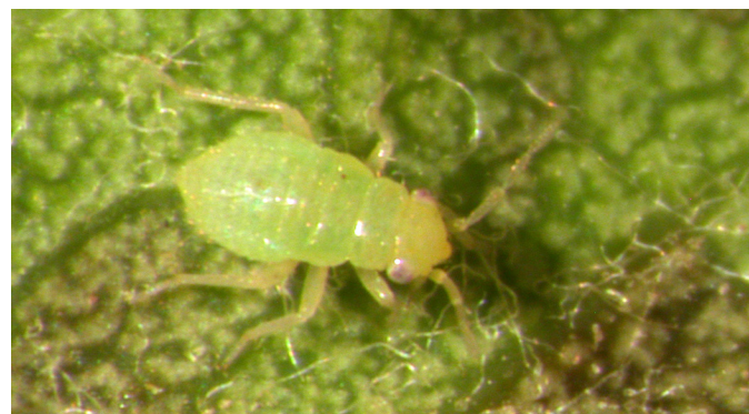
Young nymphs cause injury to apples when they feed on blossom calyxes and developing fruit.