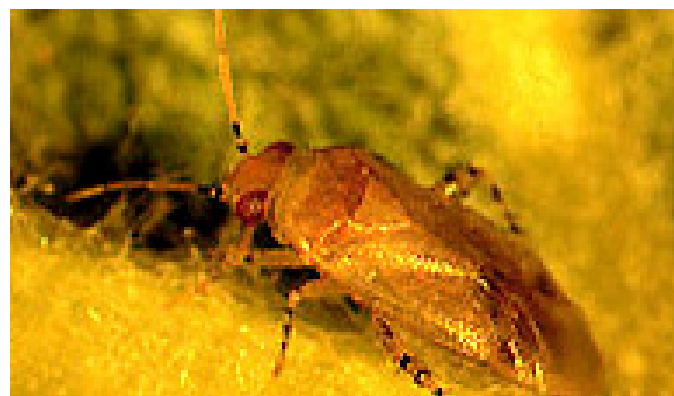
The adult is a beneficial predator of aphids, mites, and pear psylla.