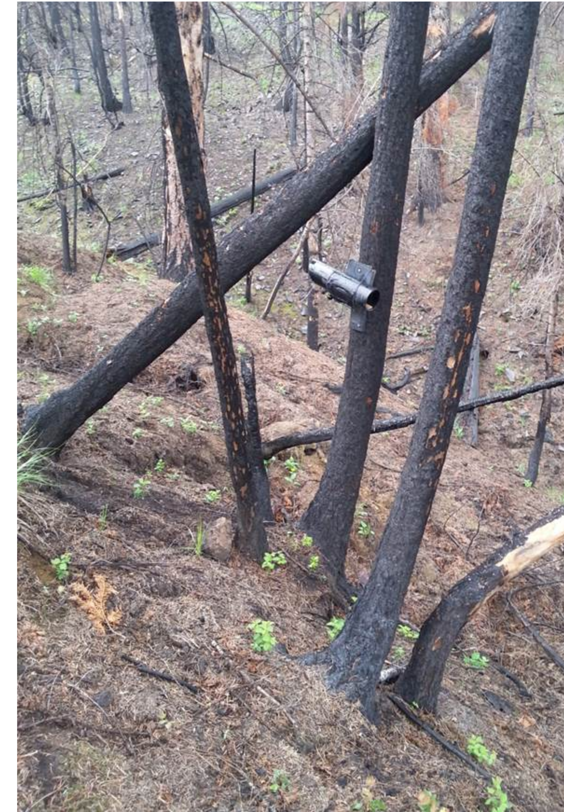
Figure 2: Camera setup mounted away from the nest.