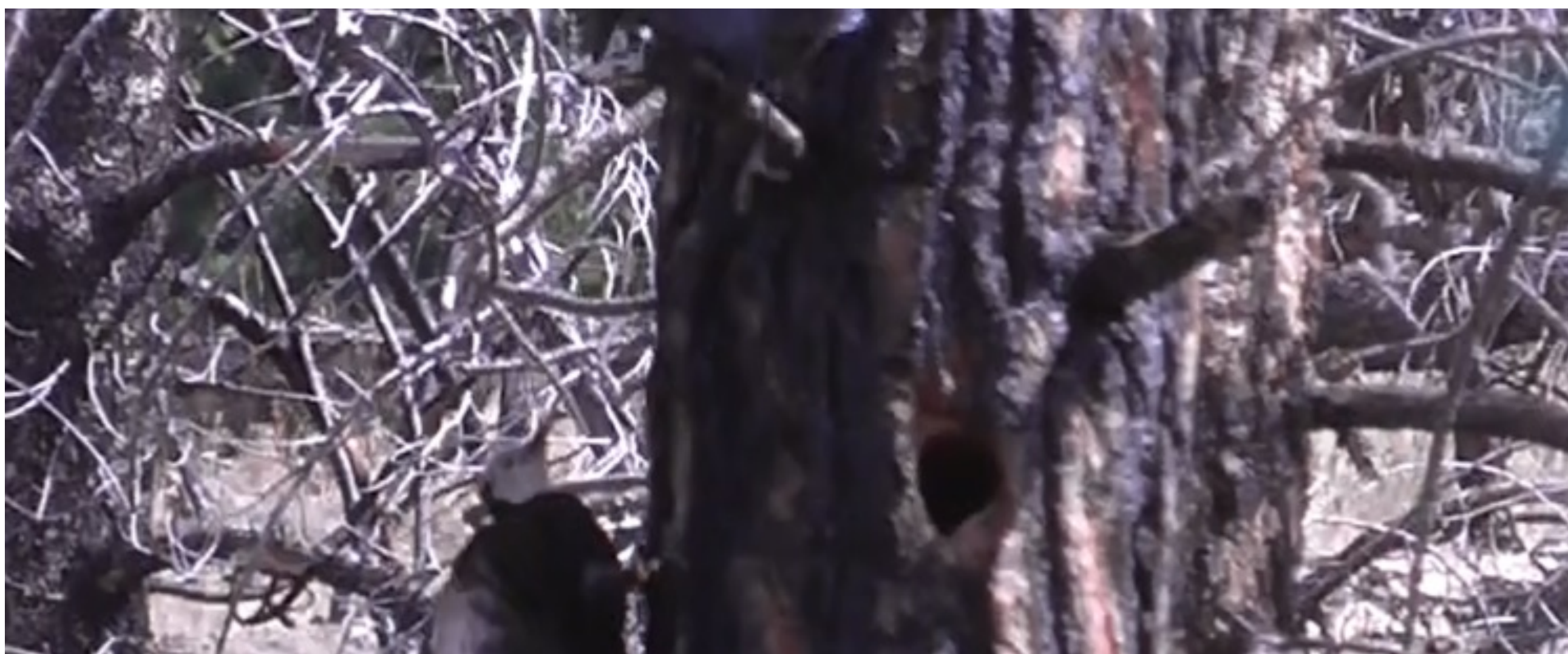
Figure 3: Still-shot of video footage from the Soup WHWO nest on 7/2/16. Here, the parent defends the nest off from a Stellar's Jay.