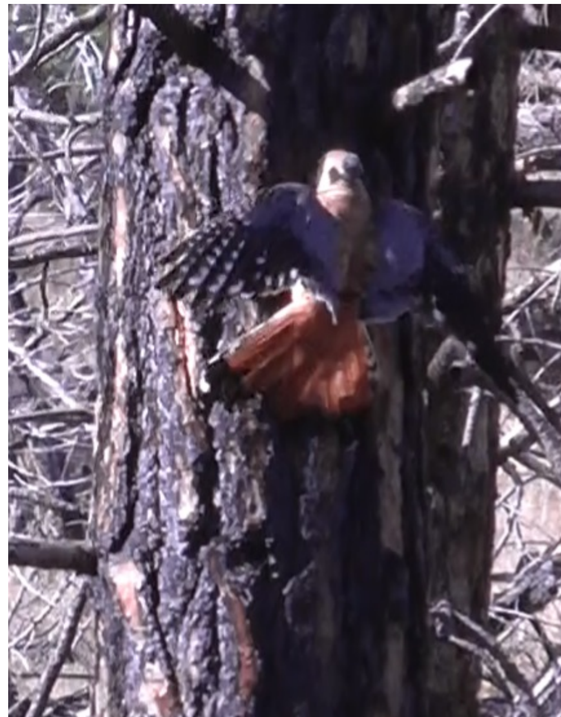
Figure 4: An American Kestrel taking a White-headed Woodpecker nestling from the same nest the Stellar's Jay visited.