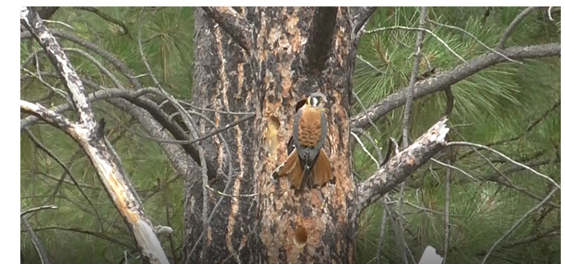
Figure 6: Another American Kestrel at a different White-headed Woodpecker nest. This visit occurred on July 5 th , around the same time the other kestrel took a nestling from the other nest.