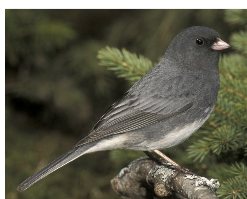
The bird on the left is a Junco. On the right is a Cedar Waxwing.