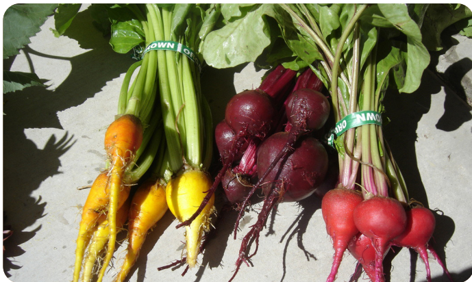
Vegetables can be bundled for distribution.

The pickup location would benefit from a sign telling shareholders how much of which produce they should take home. Shareholders could also trade produce with each other to cater to their personal taste. Youth Garden Project's CSA in Moab, Utah, allows shareholders to leave any produce they will not use in a designated basket, and others are able to take this produce if they wish when they pick up their shares. If you choose to offer pick up in bulk