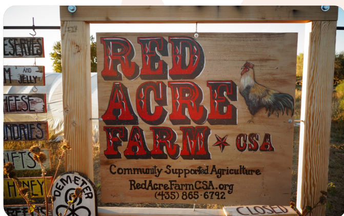
Red Acre Farm CSA in Cedar City, Utah.

the land and operation. Without the need of relocation, you can also create and maintain a constant tie to the local community and shareholders. A potential barrier would be the cost of land.