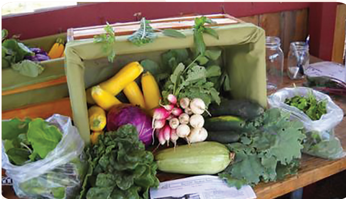
CSA Share Example.

Determining the Share Size: Many CSAs offer a full-size share or half-size share to shareholders. A full-size share should provide enough food for a family of four throughout the week (CSA Utah, n.d.). Full-sized shares are intended for more than two people, are priced at a higher rate, and are either delivered more often to shareholders or with more produce per share. A half-sized share is intended for two people.