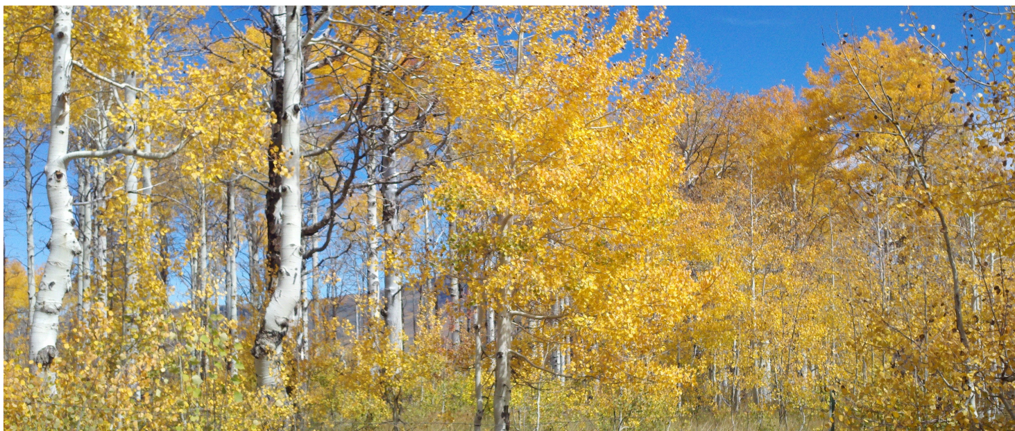
Multiple age-classes of quaking aspen on Cedar Mountain, Utah.

This fact sheet describes research conducted at Utah State University that identified factors to improve the success of regenerating aspen in southern Utah. Evaluating past silvicultural regeneration treatments indicated that the presence of pre-harvest advance reproduction, site preparation by broadcast burning, and decreasing browsing pressure could increase the quantity of aspen regeneration. The outcomes are generalized into an easy-to-use model, the Aspen Pyramid, to facilitate decision-making regarding regenerating aspen.