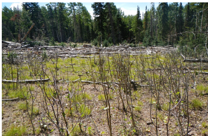
Figure 4. In this post-treatment stand, aspen suckers were plentiful and are on average 3 feet tall. Unfortunately, virtually every regenerated aspen had been browsed, which represents intense herbivory. If browsing this intense was encountered prior to treatment, recommendations to reduce browsing intensity should be followed.

“ Our study results suggested that both broadcast burning and domestic animal relief...were the best techniques for improving the density of regenerated aspen. ”