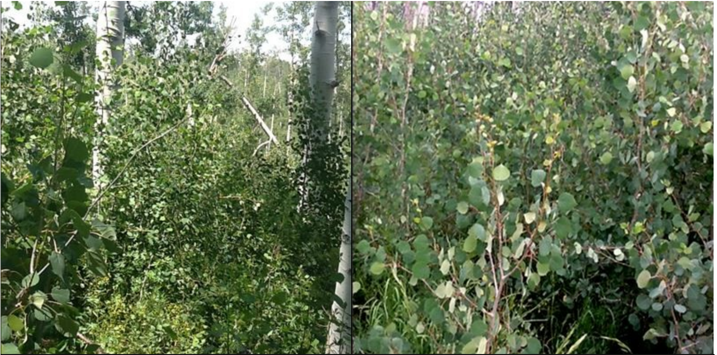
Figure 2. A strong component of advance reproduction prior to overstory removal (left) is an excellent predictor of the response of suckers to treatment (right). Monitoring for the presence of advance reproduction is recommended prior to conducting overstory removal.

primary factors on aspen, we can recommend practical and effective aspen management strategies. Following this discussion, we describe how the factors were incorporated into a useful Aspen Regeneration Decision Pyramid which can be consulted prior to making decisions about how to regenerate an aspen stand.