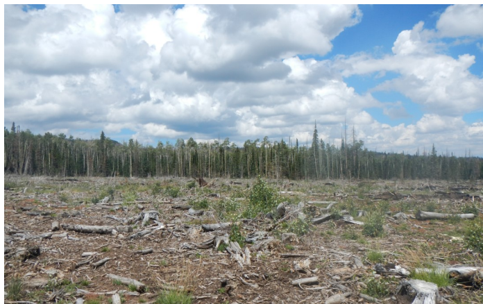
Figure 3. Site preparation can have a dramatic influence on the quantity of aspen suckers post-treatment. These stands are adjacent to each other on the landscape and overstory removal was conducted over 2 years, (top) was subject to pile-and-burn, and (bottom) was broadcast burn.

Consider the following hypothetical example of an aspen stand being evaluated for treatment. The stand has approximately 400 stems per acre, is 150 years old, and has moderately healthy looking crowns. The amount of advance reproduction is minor with only a few stems in a radius of about 20 feet. However, half of those stems have evidence of browsing on the terminal bud. The landowner is