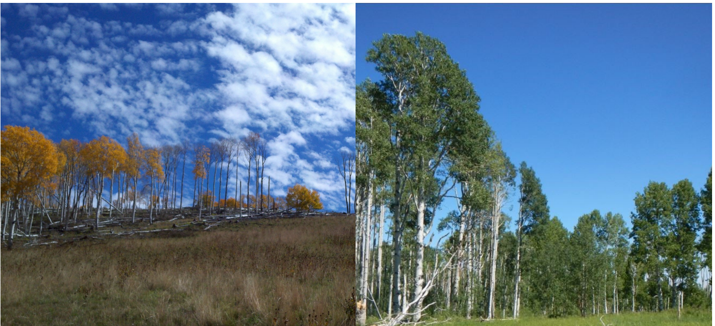
Figure 1. Stands in poor condition (left) are less likely to express a vigorous response to treatment than healthy stands (right). Stands in poor condition have dying overstory trees, open sparse foliage in the crowns, and a lack of young stems, whereas stands in good condition have substantial leaf area, limited mortality, understory aspen, and could also have multiple cohorts (heights) of aspen stems.

Here we describe these important factors in detail and explain how to monitor and make management decisions about an aspen stand. By better understanding the influence of these