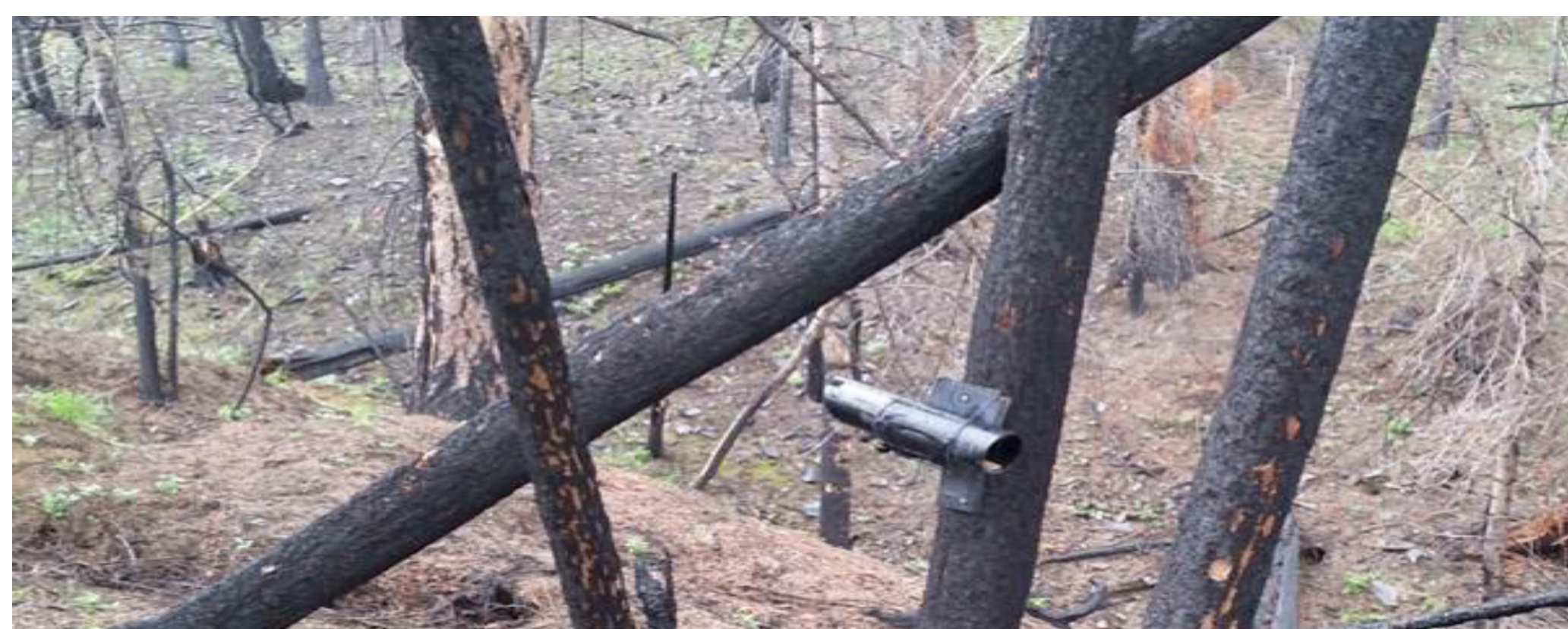
Figure 2: Camera setup mounted away from the nest.