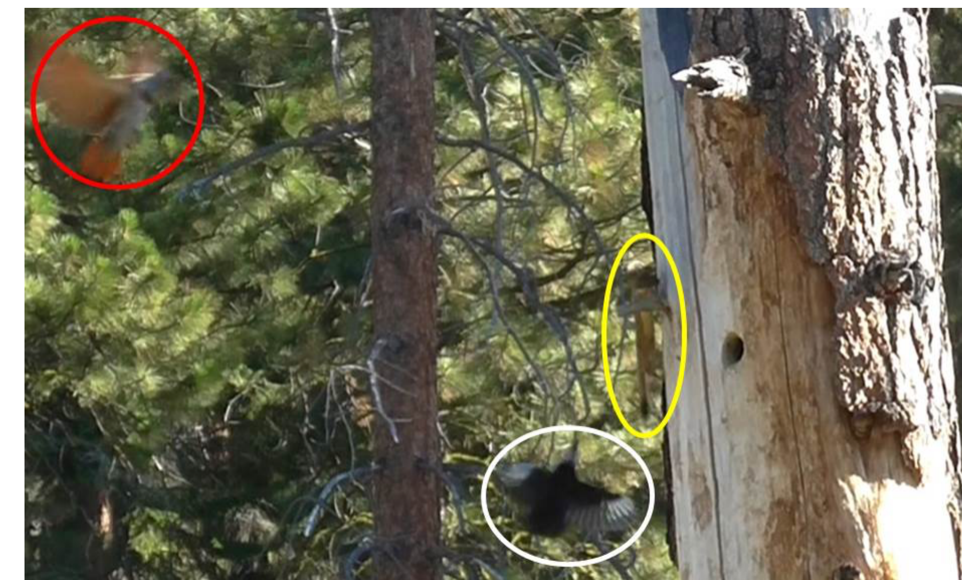
Figure 6: An example of communal nest defense as both the White-headed Woodpecker (white) and Northern Flicker (red) defend the 1304 Whwo nest from a the Long-tailed Weasel (yellow).