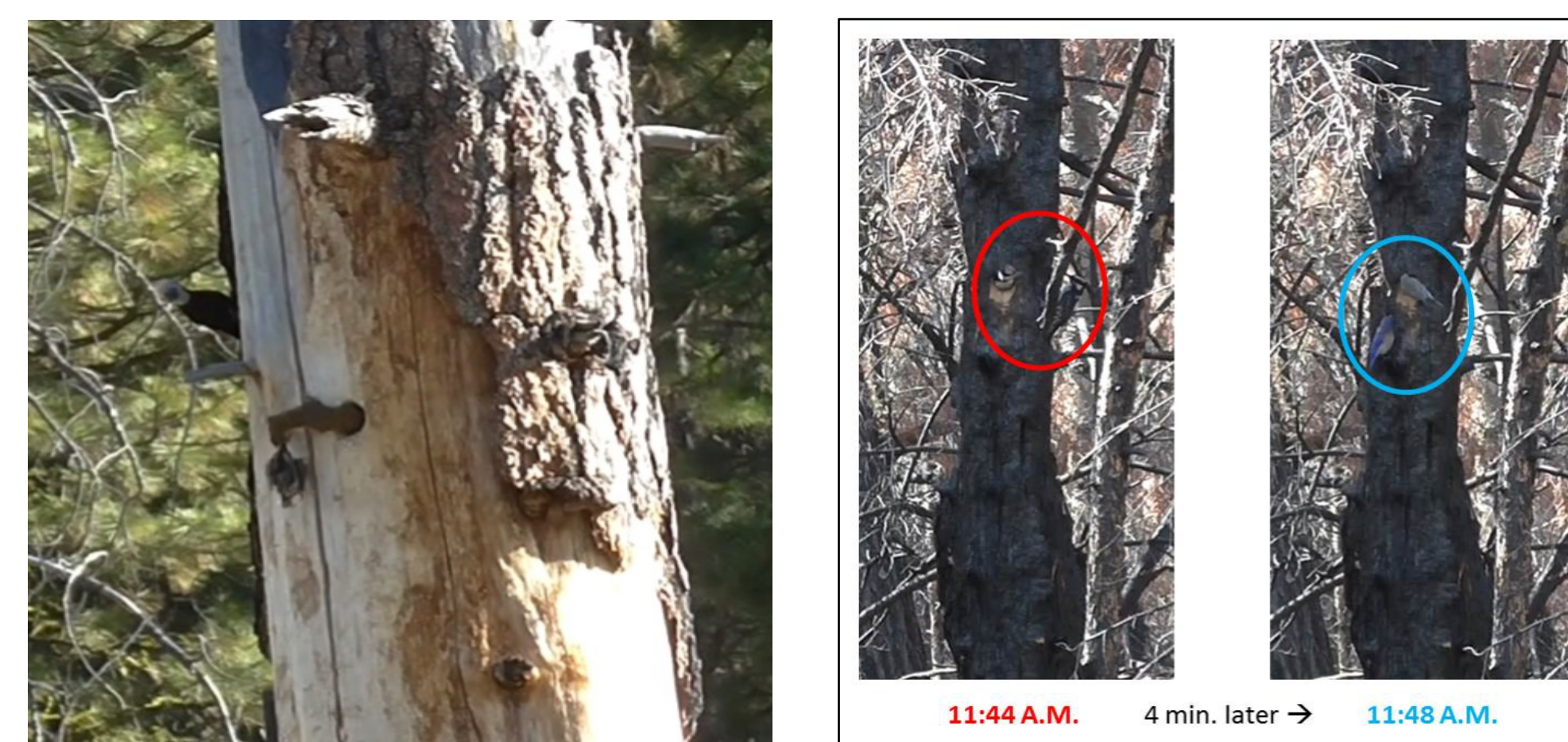
Figure 3 (left): Long-tailed Weasel taking a White-headed Woodpecker nestling as the male woodpecker tries to protect its chick.